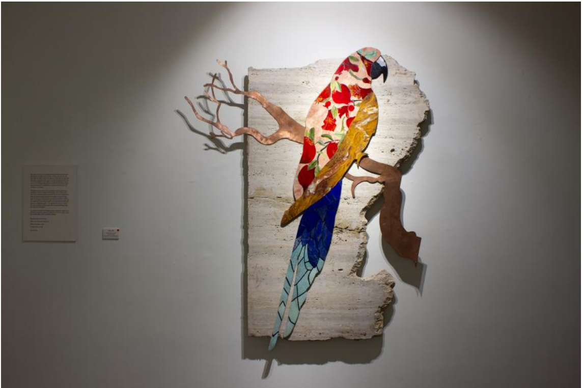
Show images: War Gardens by Studio Lel