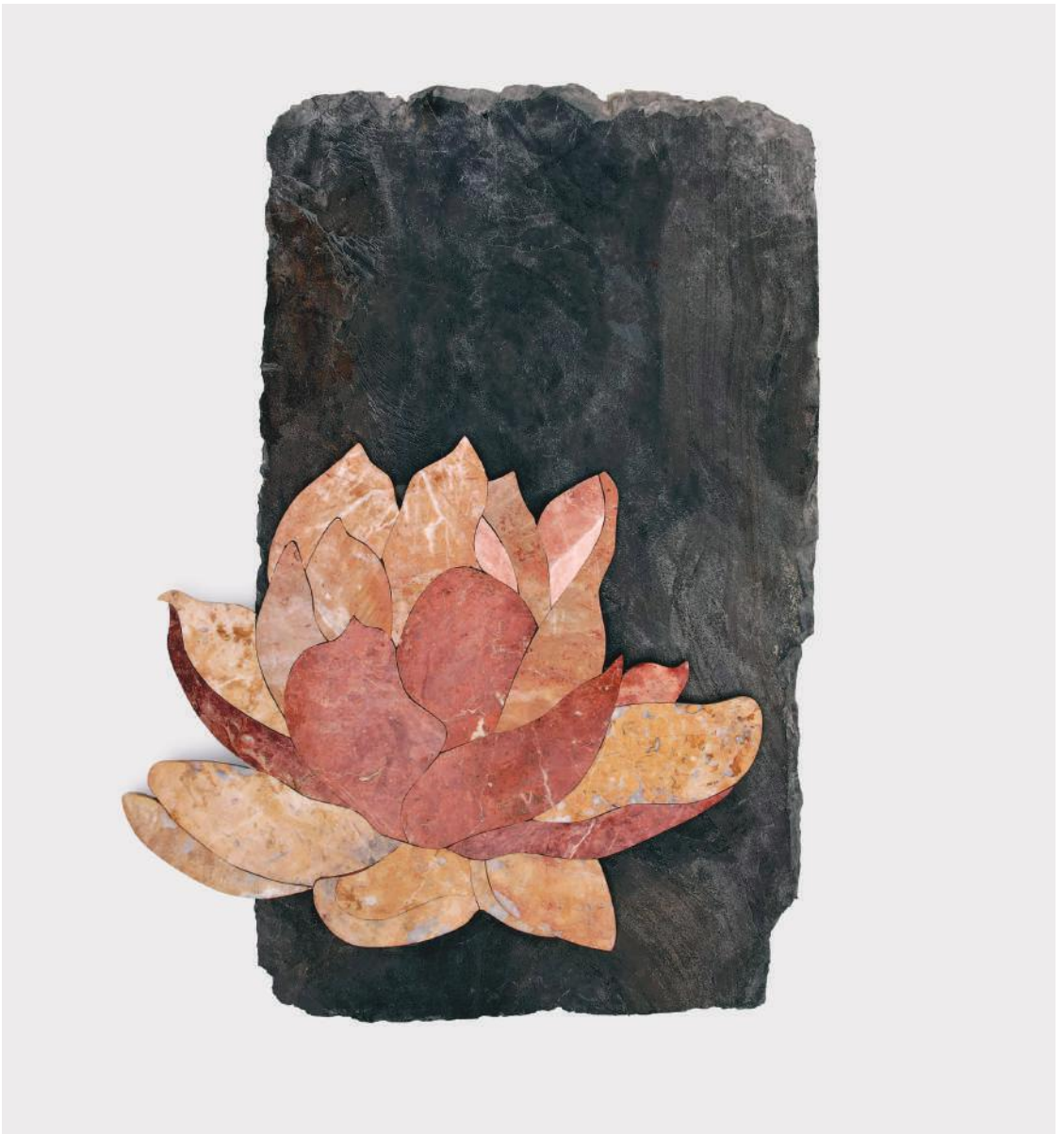
Lotus I, 2023 Marble, Slate. Pietra Dura, Sculpture. 38" x 28" x 1"