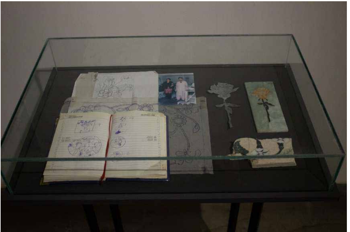
Show images: War Gardens by Studio Lél's