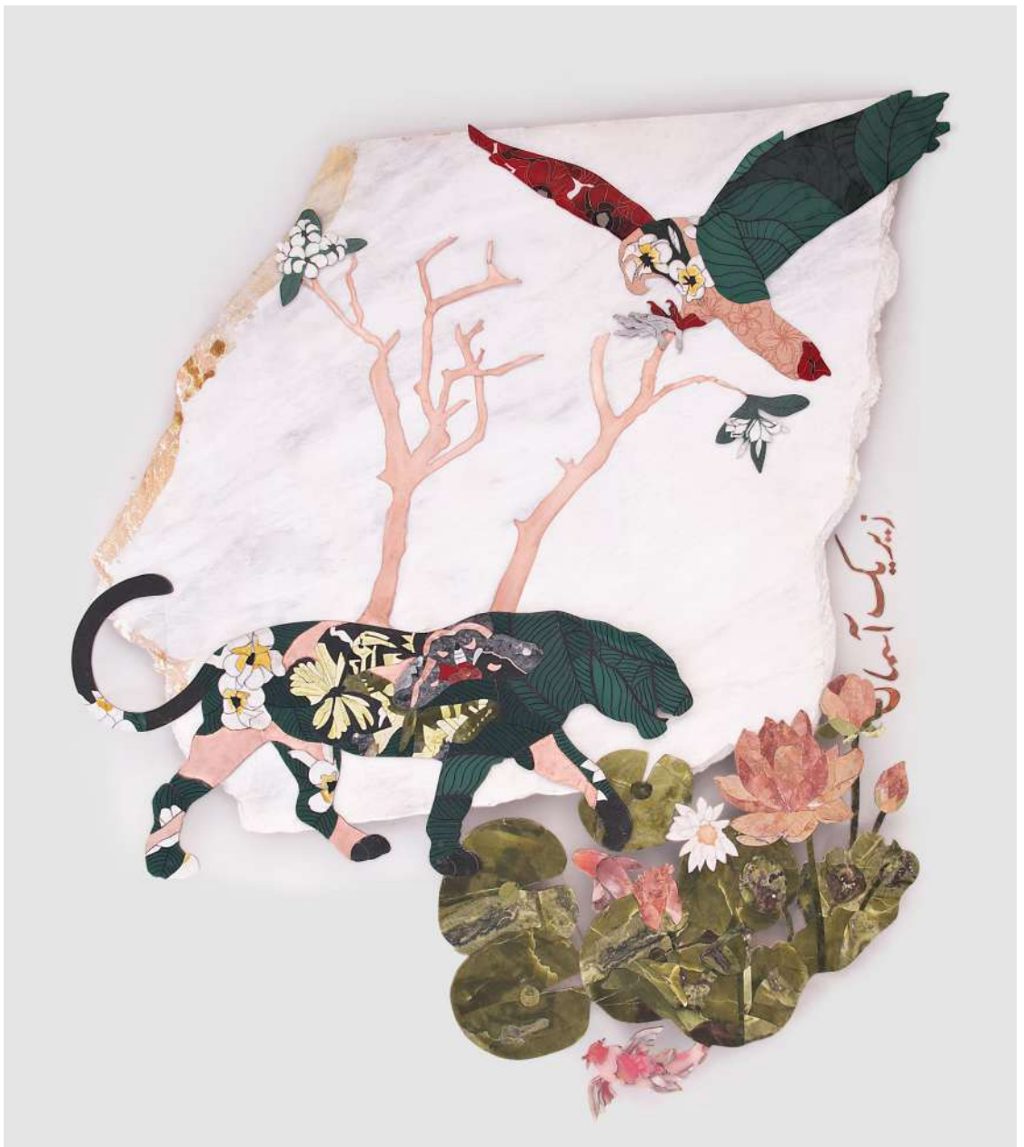
Zer Yak Asmaan (Beneath The Same Sky), 2023 Serpentine, Marble, Plaster, Copper, Metal. Pietra Dura, Scagliola, Cloisonné, Copperwork. 80" x 70" x 1.5"