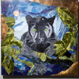
Show images: War Gardens by Studio