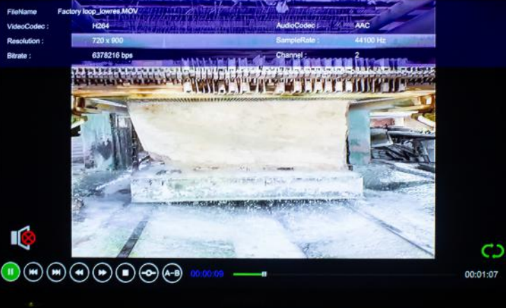
Show images: War gardens by Studio Lél's