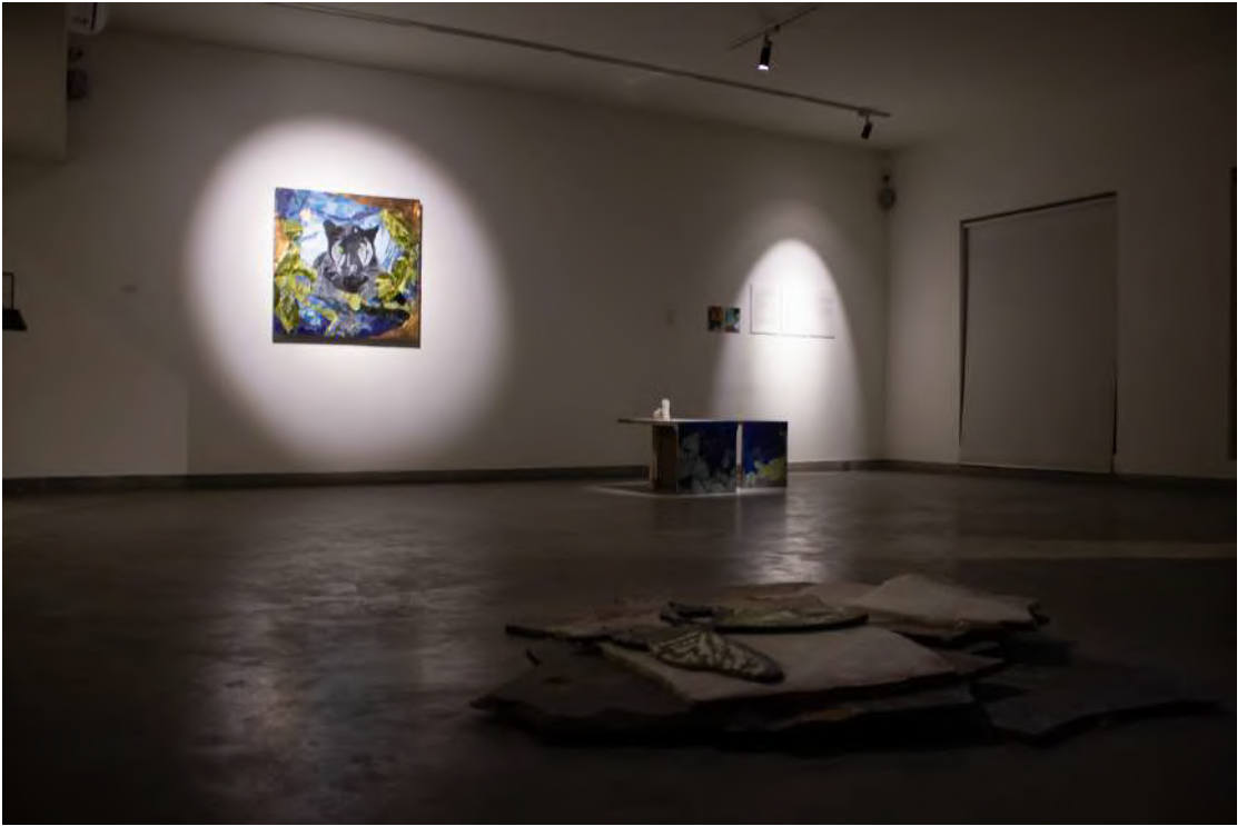
Show images: War Gardens by Studio Lél's