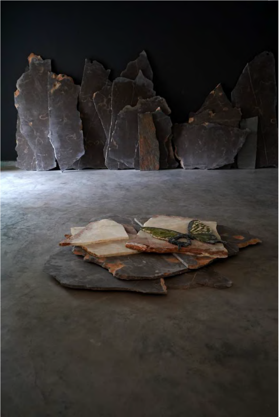
Show Images: War Gardens by Studio L&S