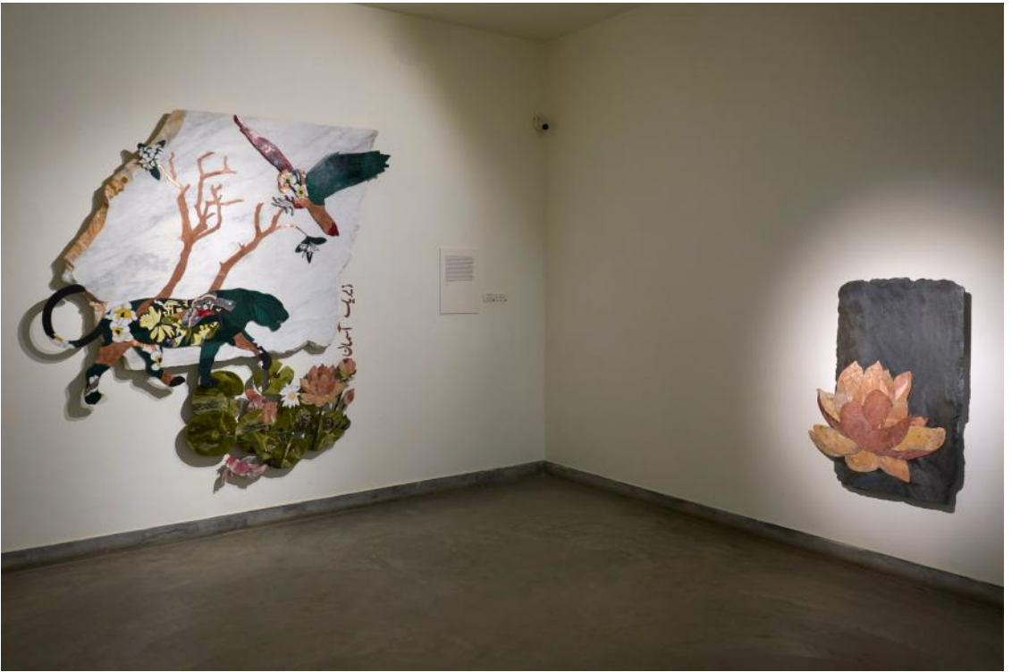
Show images: War Gardens by Studio