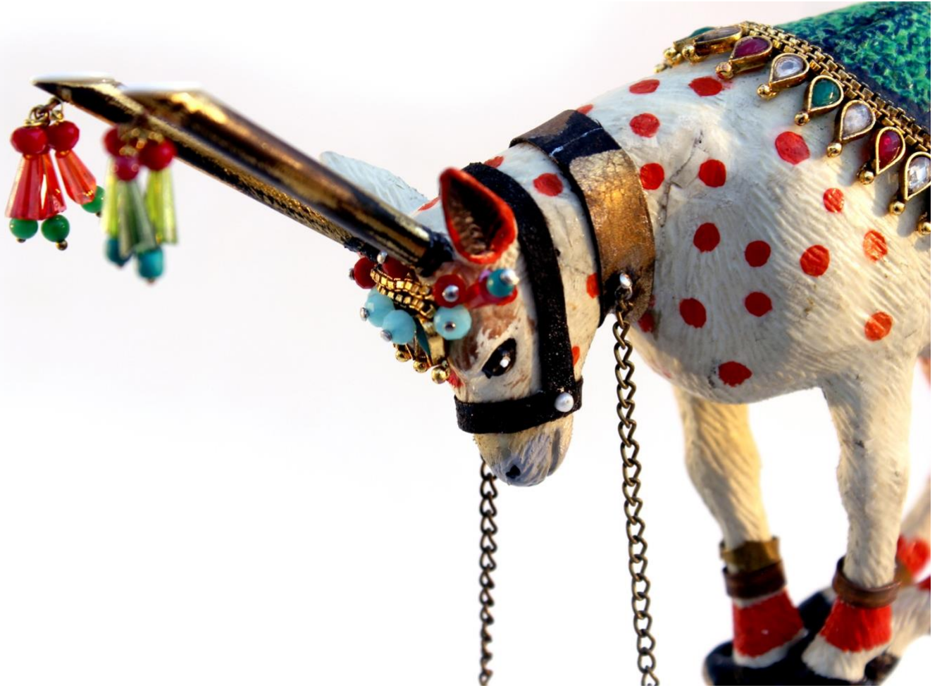
Baghpati, Bakri wala, 2023 (work detail)