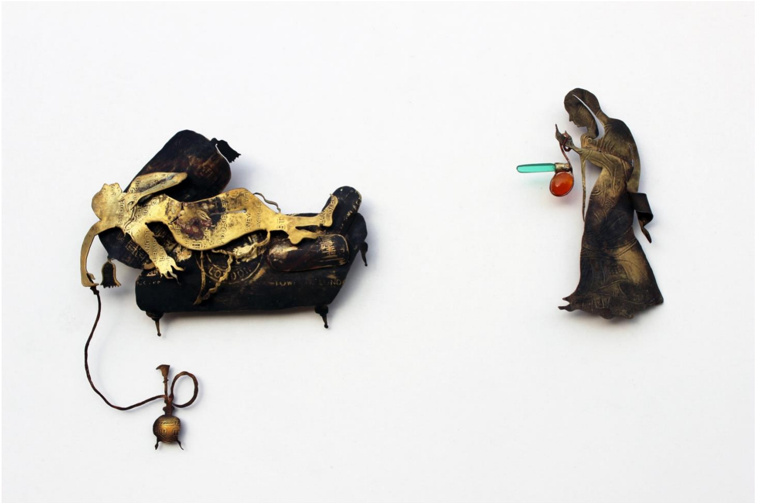
Baghpati, lady not yearning for her lover, 2023 (work detail)