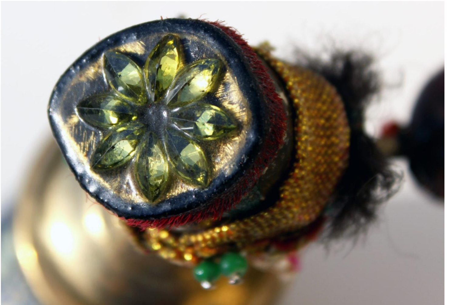
Baghpati, Sapera, 2023 (work detail)