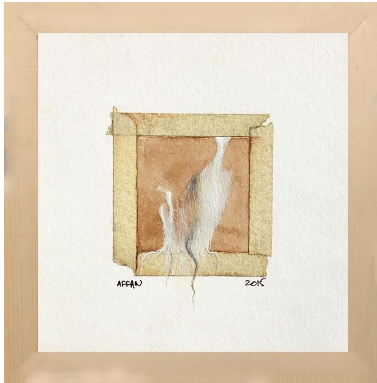
Dari ; gouache on wasli; 6(3/4) x 6(3/4) inches; 2015.