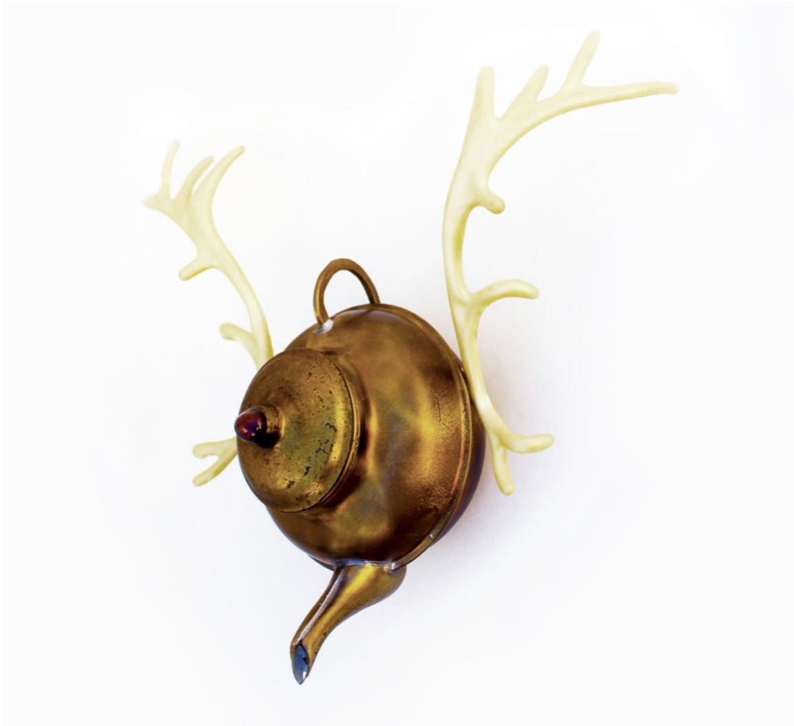
kettle ; assemblage, steel, plaster, green zarkon stone, brown Aqeeq; 9 x 7 1/2 x 3 inches; 2023.