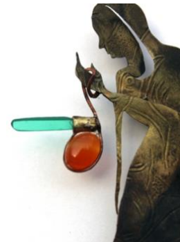
Baghpati, lady not yearning for her lover, 2023 (work detail)