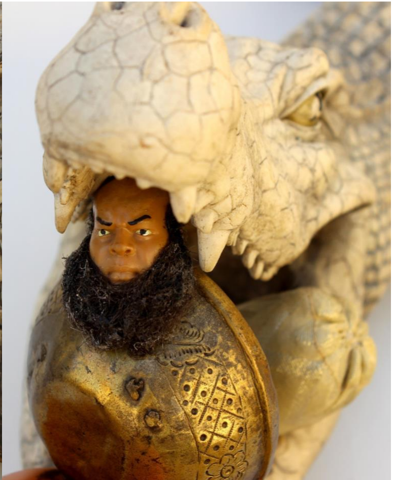
Baghpati, Under my umbrella, 2023 (work detail)