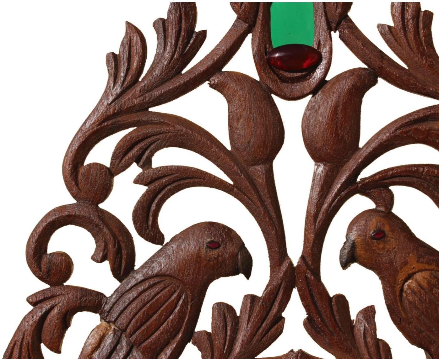
Baghpati, Baja-Raja, 2023 (work detail)