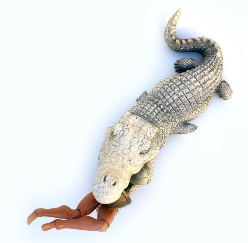
Baghpati, Under my umbrella, 2023 (work detail)