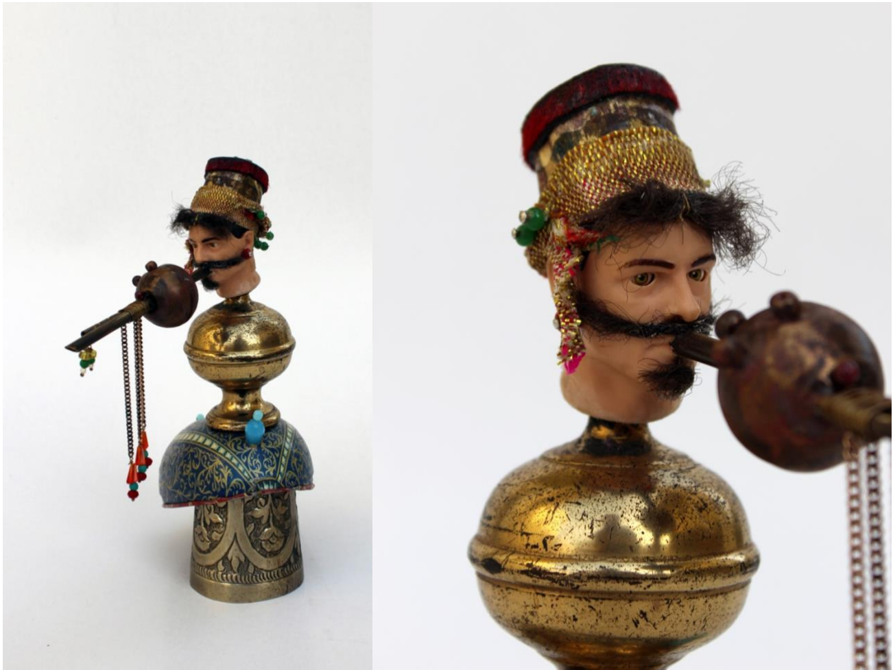
Baghpati, Sapera, 2023 (work detail)