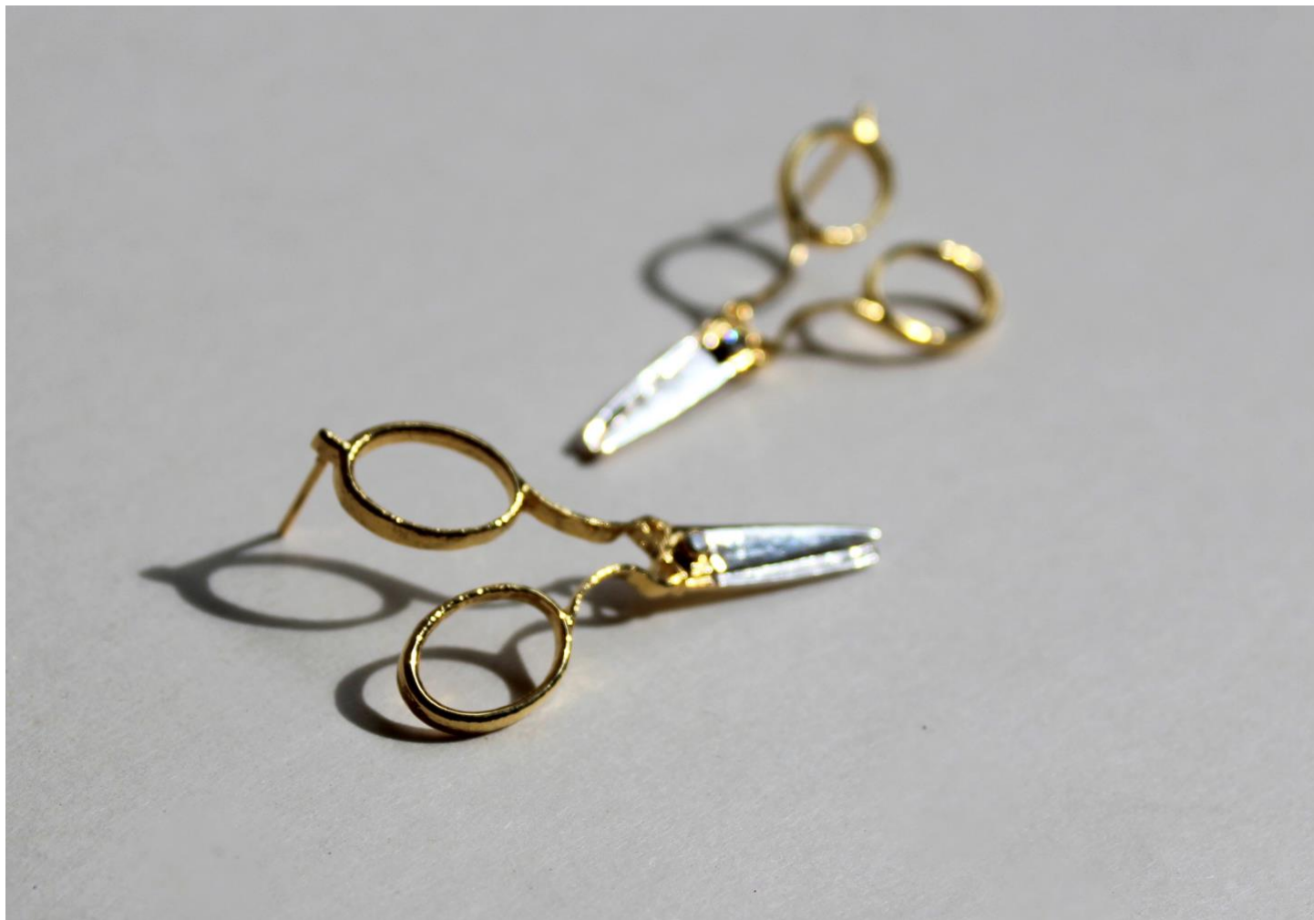
Scissors ; sterling silver, zarkon, silver and gold plated; 2022.