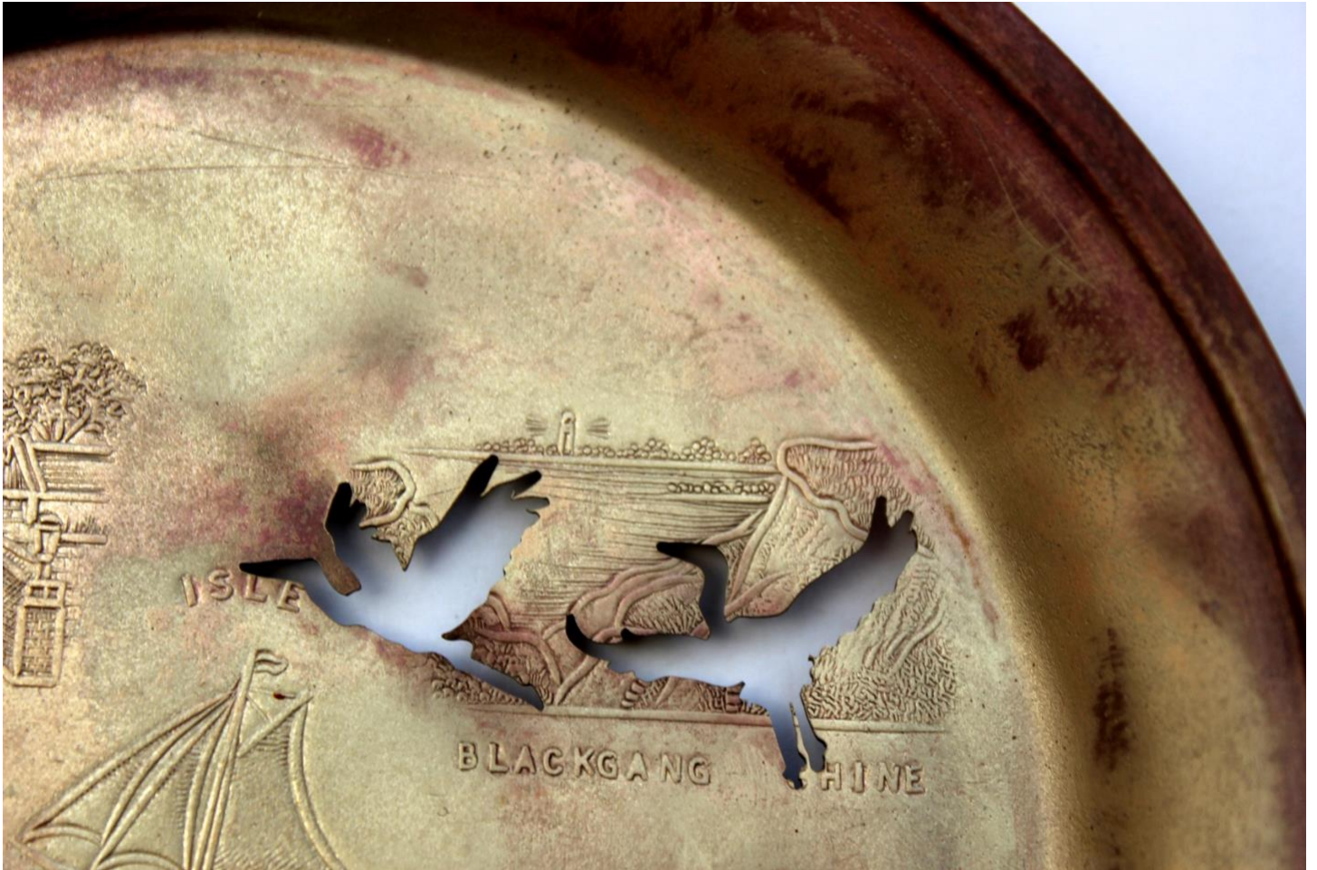
Baghpati, lady not yearning for her lover, 2023 (work detail)