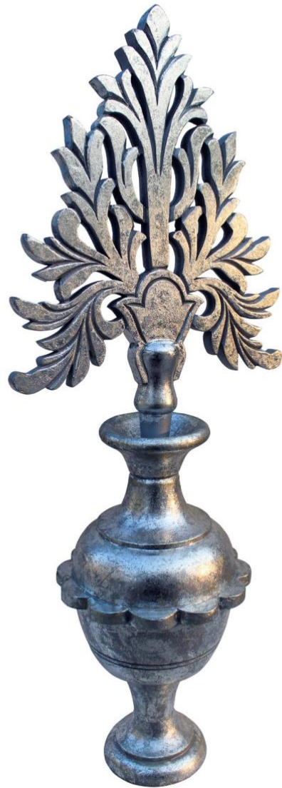
silver surmadani ; (3 editions); hand carved, teak wood, compressed MDF, foiling; 30 x 11 x 8 inches; 2023.