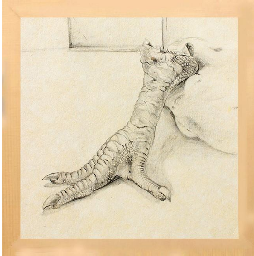
Panja ; graphite on paper; 6 (3/4) x 6 (1/2) inches; 2012.