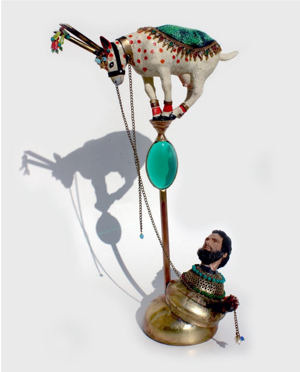
Bakri Wala ; assemblage, found objects, brass, vinyl, glass beads, glass stone, synthetic hair; 12 x 5 x 5 inches; 2023.