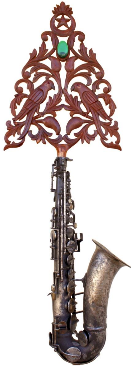
Baghpati, Baja-Raja, 2023 (work detail)