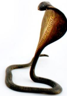
Sapera; assemblage, found objects, brass, copper, vinyl, glass beads, semi precious stones, zarkon crystals, synthetic hair, acrylic paint; 7(1/2) x 6 x 6 inches, 4 x 4 x 4 inches; 2022.