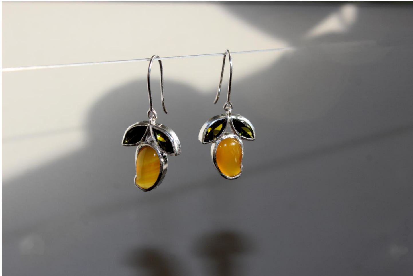
mango sterling ; sterling silver, yellow Aqeeq, green Zarkon, (not plated); 2022