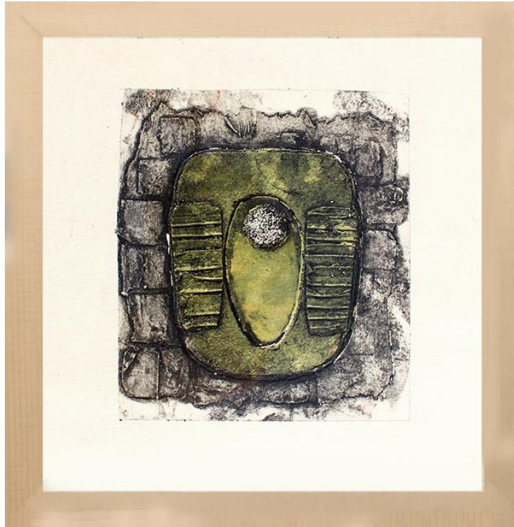
Na-paak ; collagraph (plate), grey paper, manual press; 6(3/4) x 6(3/4); 2013.