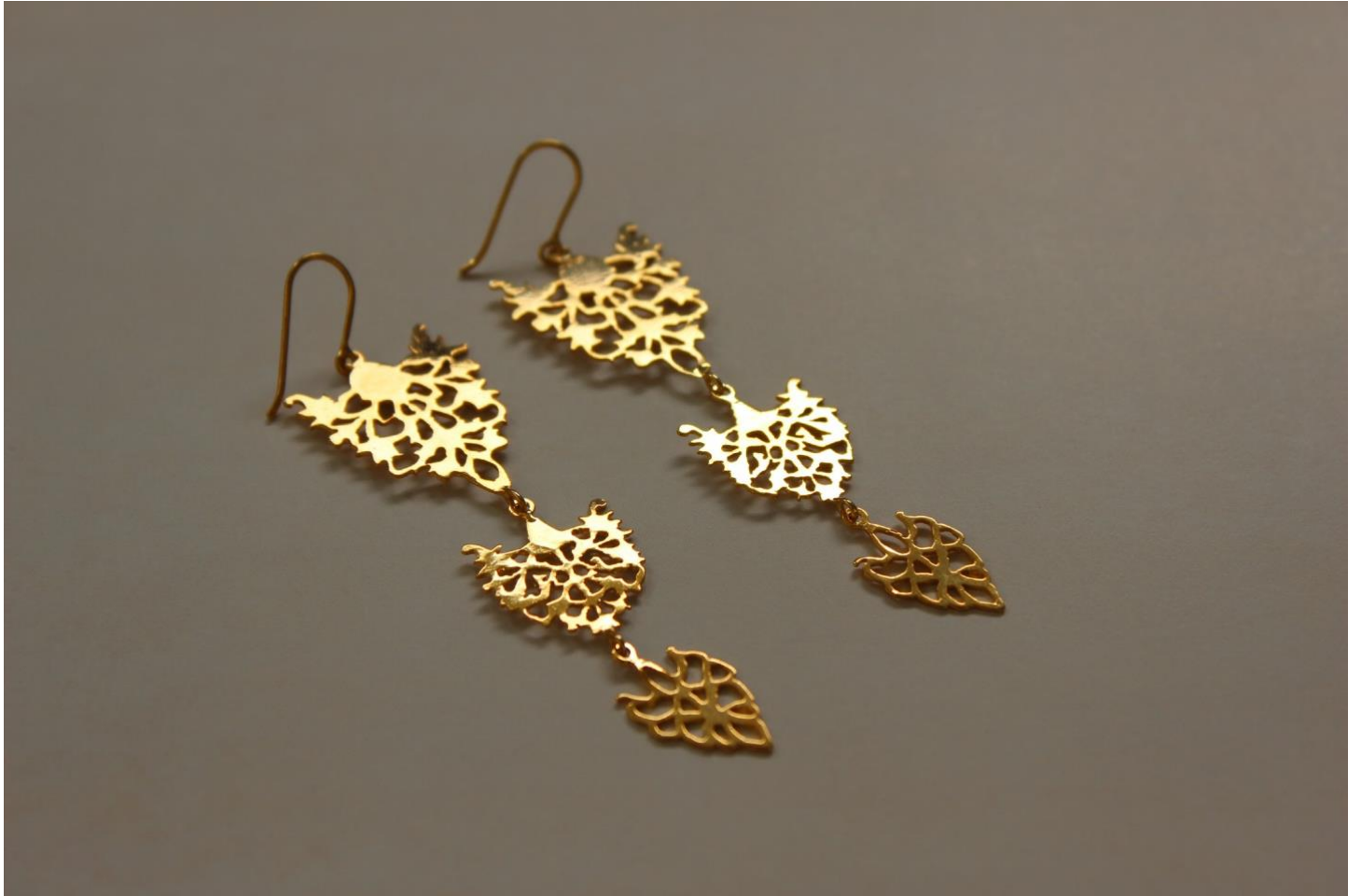
teen-taal ; sterling silver; gold plated; 2022