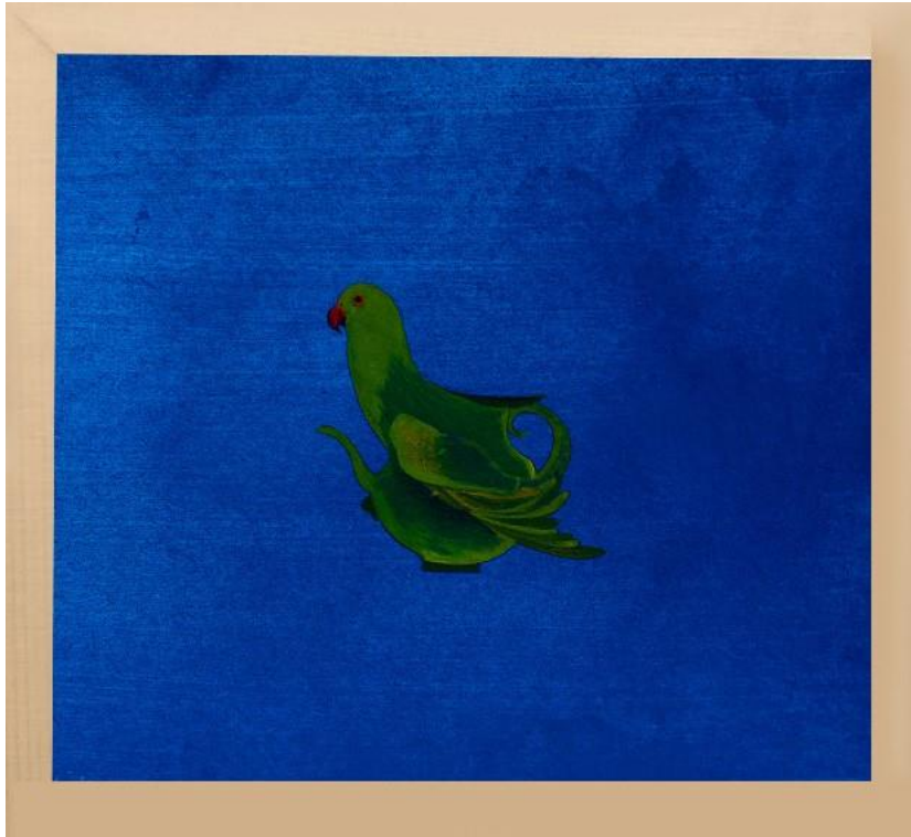
tota lota ; Gouache on wasli; 6(3/4) x 6(3/4); 2015.