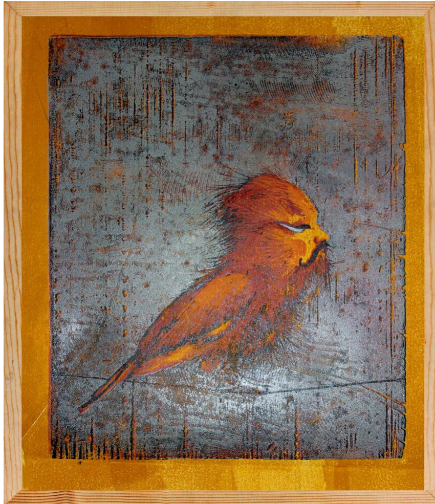
self-bird ; wood cut (reductive method), manual press, print on paper; 13 x 10 (3/4) inches; 2013.