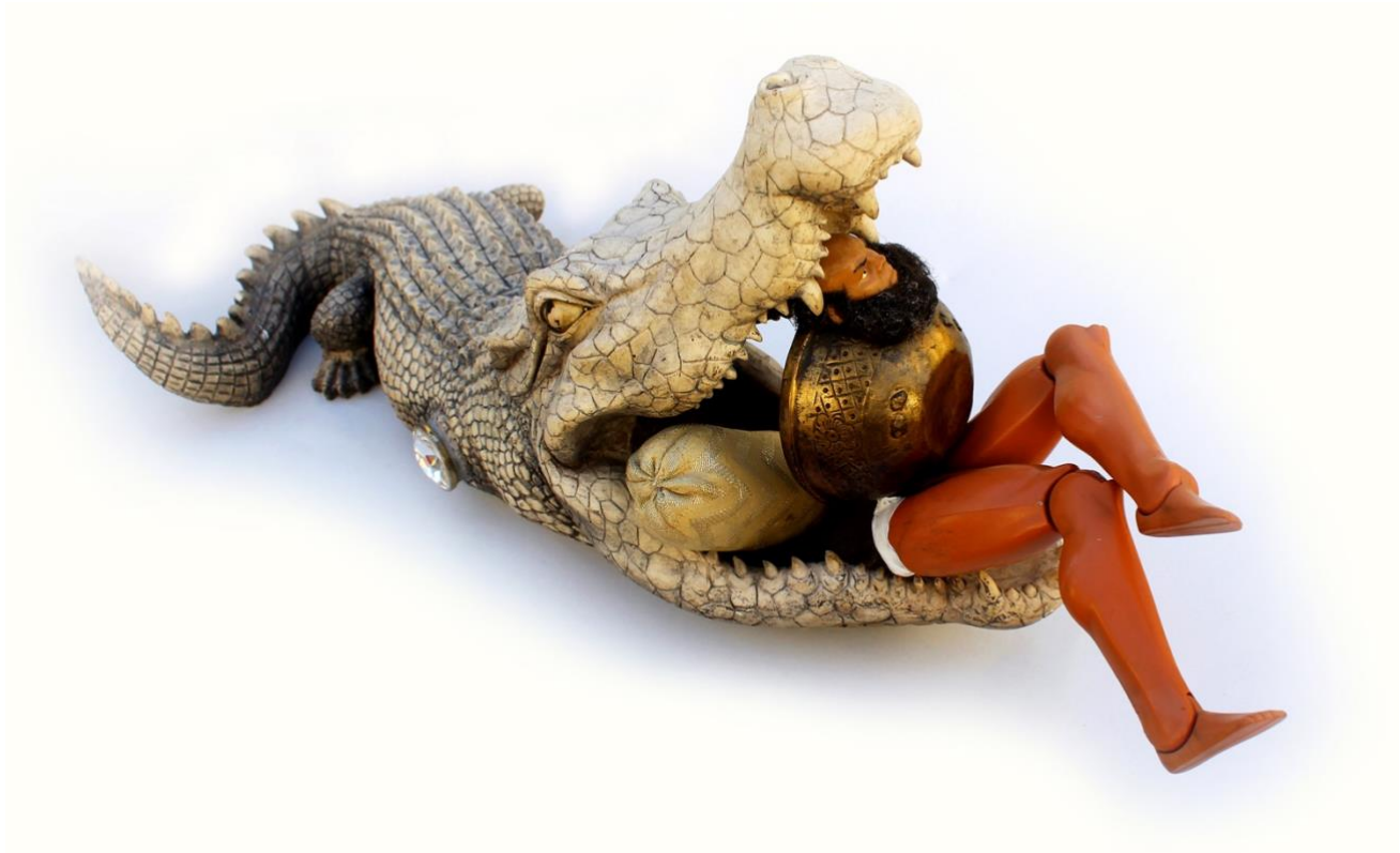
Under my umbrella ; assemblage, found objects, brass, copper, porcelain, vinyl, synthetic hair, acrylic paint; 9 x 19 x 8 inches; 2023.