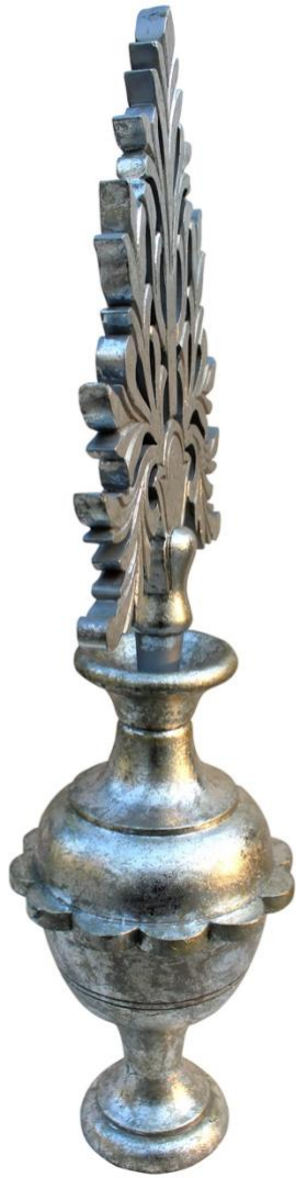
Baghpati, Silver Surmadani, 2023 (work detail)