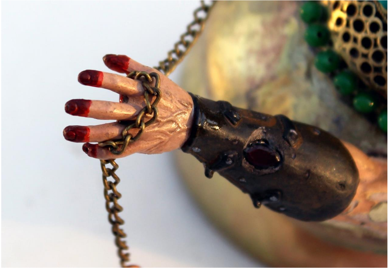
Baghpati, Bakri wala, 2023 (work detail)