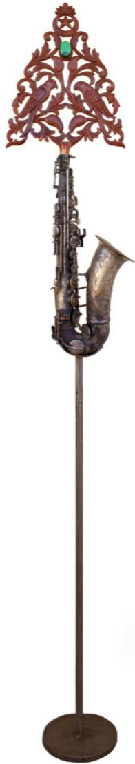
Baja-dani ; assemblage, found object (saxophone, Boosey & Hawlks LTD, makers London, serial number: 31664), hand-carved burma teak phool-jaal), iron rod stand/holder; object: 38 x 16 x 10 inches; total height with stand: 87 inches; 2023.