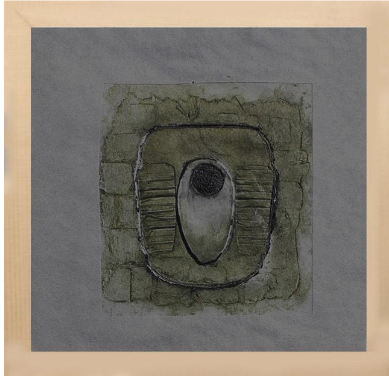
Paak ; collagraph (plate), grey paper, manual press; 6(3/4) x 6(3/4); 2013.