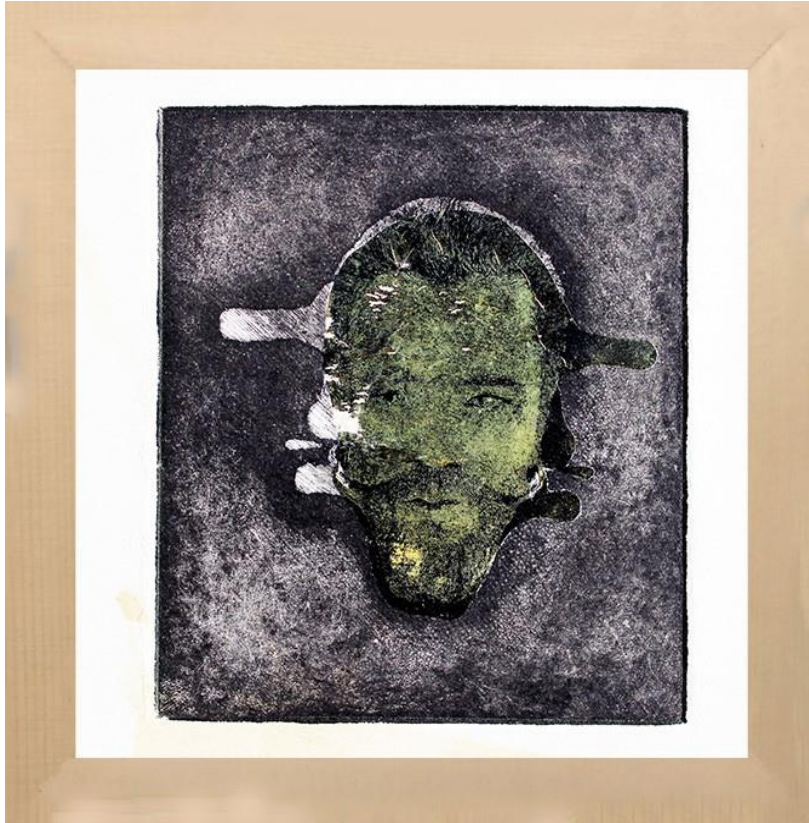
self-melt ; chine-collé, top roll, manual press; 6(3/4) x 6(3/4) inches; 2013.