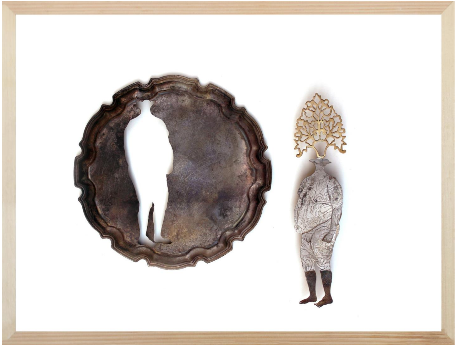
Pehelwan ; hand-sawing, steel plate, silver solder, brass; 13 x 18 x 3 inches; 2022.