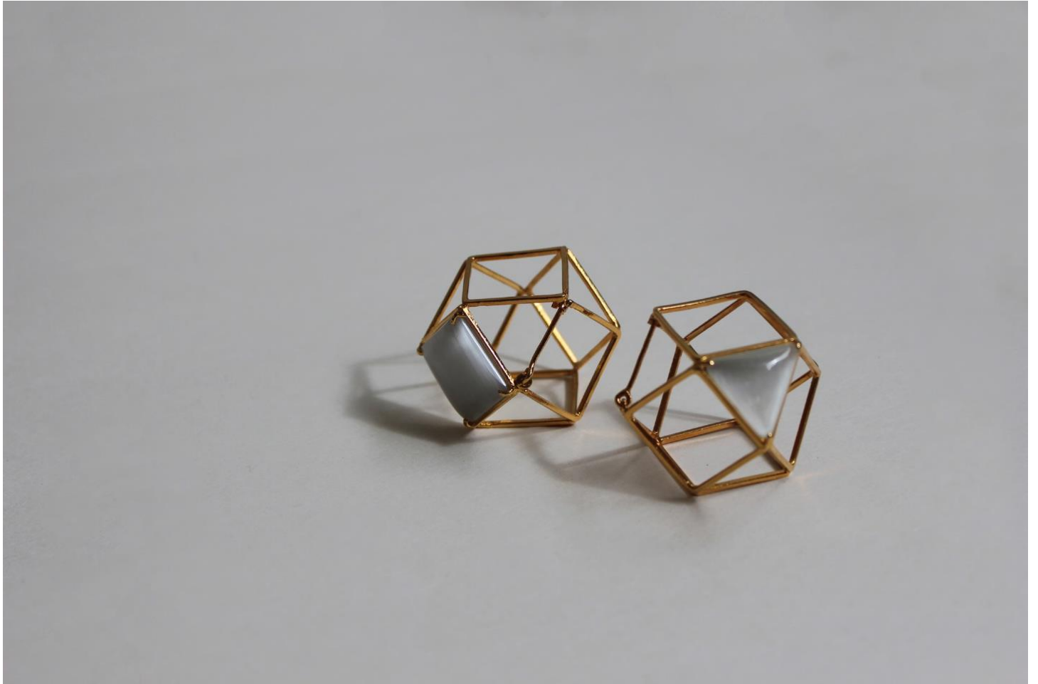
Structure ; sterling silver, semi precious stones, gold plated; 2022.