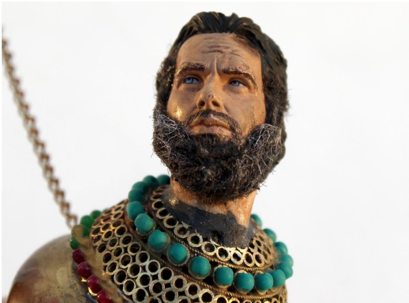
Baghpati, Bakri wala, 2023 (work detail)