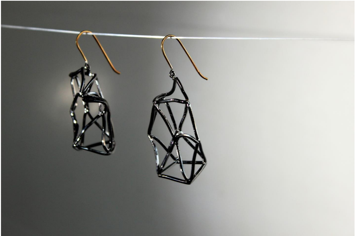
structure ruptured ; sterling silver, rhodium plated, gold plate; 2022.