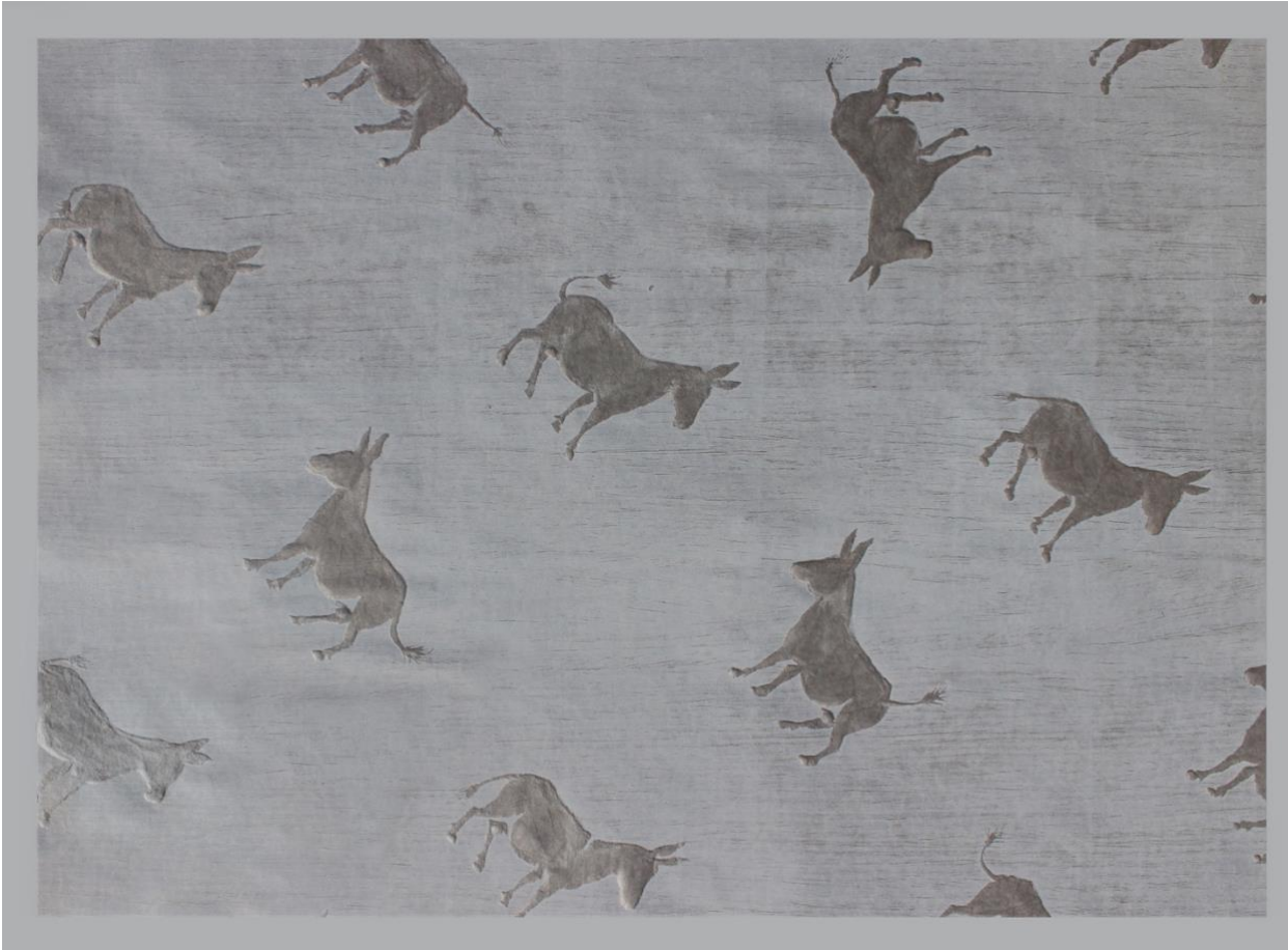
Donkey grey ; emboss print on grey card, top roll, manual press; 20 (1/2) x 28 (1/2) inches; 2014.