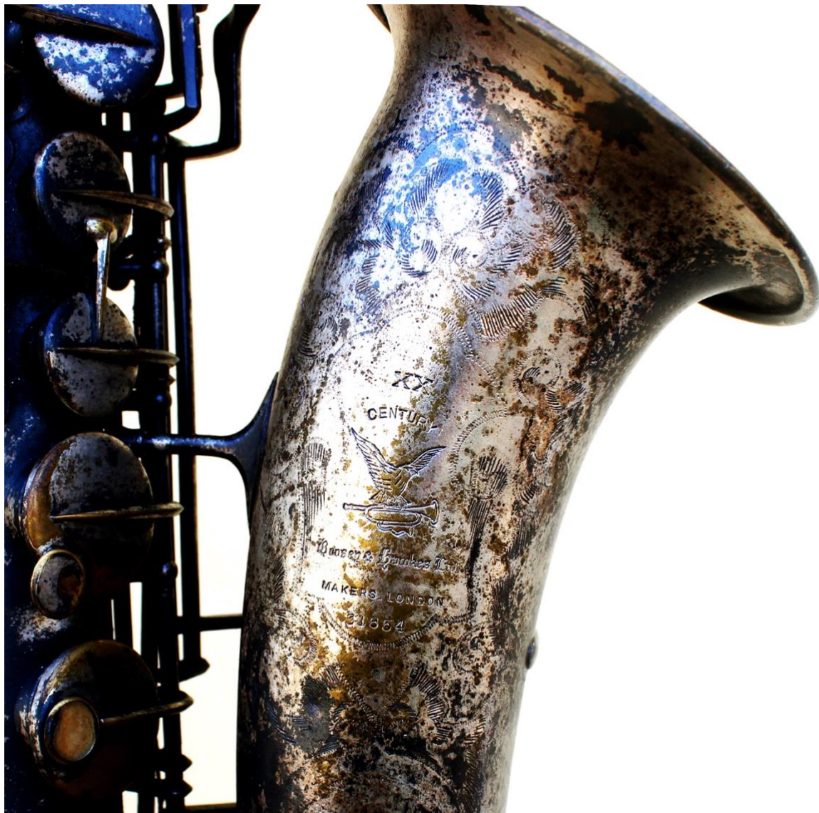
Baghpati, Baja-Raja, 2023 (work detail)