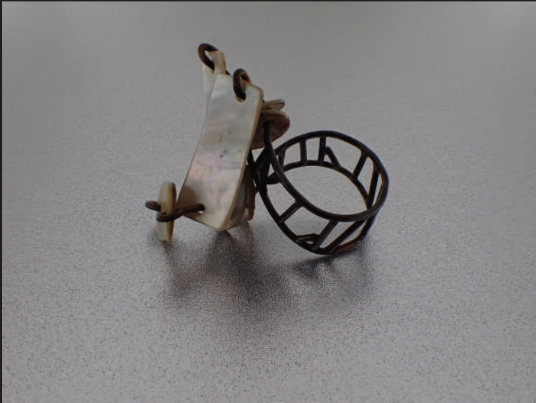
Sculpted Serenity 1 - 2022 Copper, Mother of Pearl 35 mm X 25 mm X 23 mm