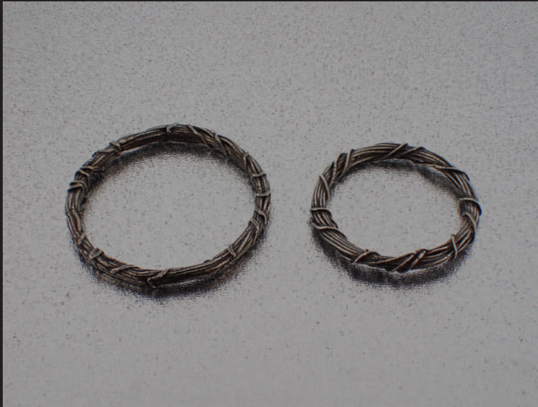
Tangled pair - 2020 Sterling Silver 22 mm X 22 mm X 2 mm