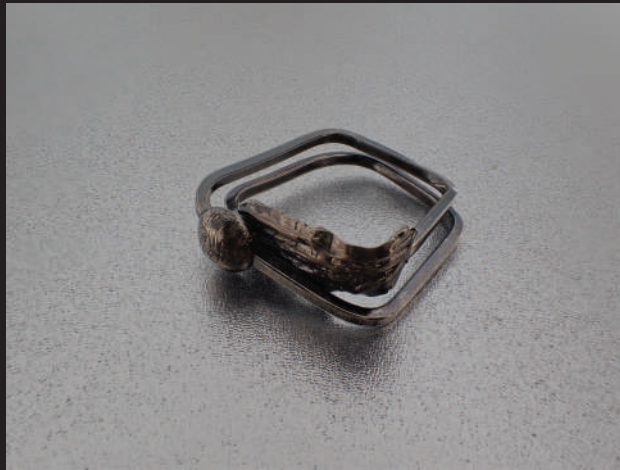
Moon and tree - 2019 Sterling Silver 26 mm X 21 mm X 6 mm