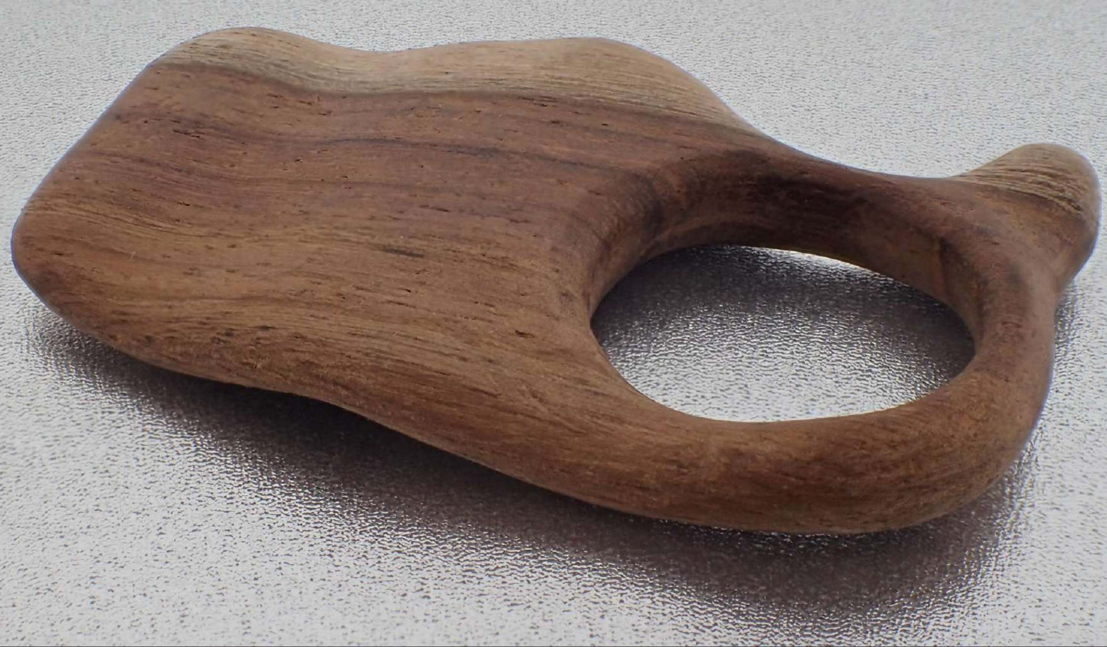
Organic Odyssey 3 - 2022 Sheesham Wood 51 mm X 34 mm X 5 mm