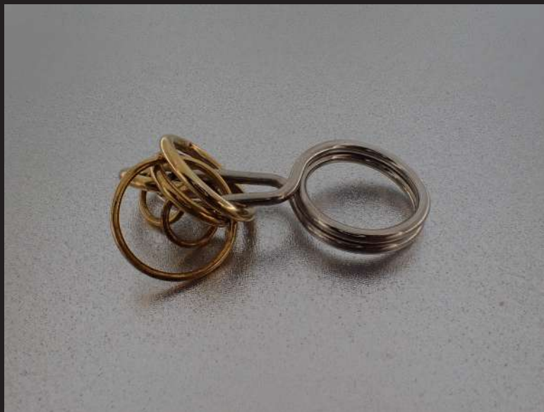
Wire Sketch 14 - 2022 Silver and Gold-plated copper 40 mm X 21 mm X 5 mm