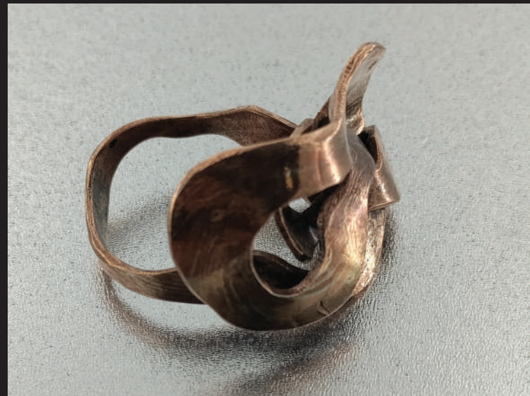
Sculpted Serenity 2 - 2022 Copper, silver 30 mm X 25 mm X 20 mm