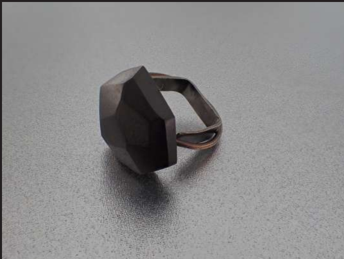
Wooden Gem - 2022 Ebony Wood, Copper, Sterling Silver 28 mm X 22 mm X 18 mm