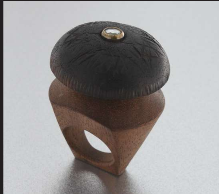
Carrier 2 - 2021 24 K Gold Kundan setting, Quartz, Sheesham Wood 55 mm X 40 mm X 40 mm