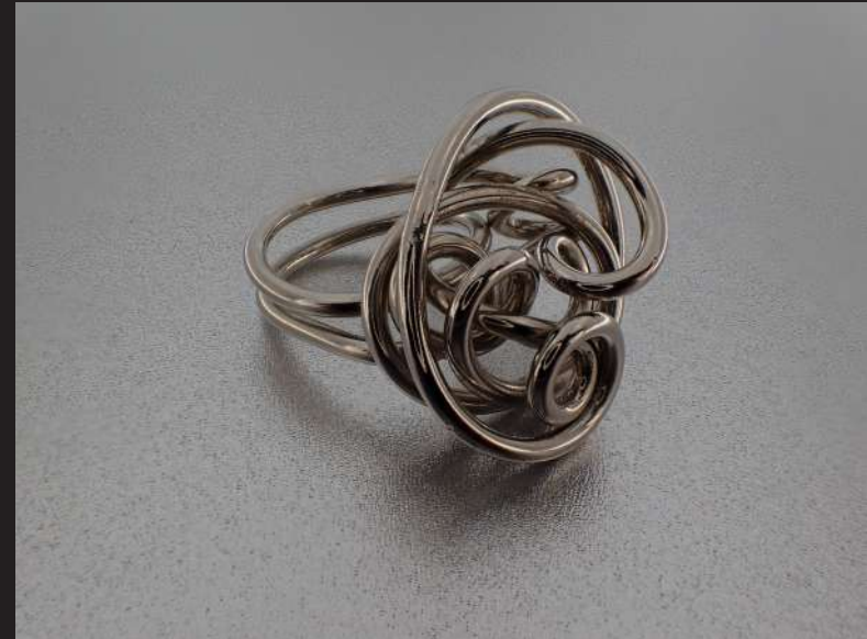
Wire Sketch 1 - 2022 Silver plated copper 37 mm X 31 mm X 25 mm