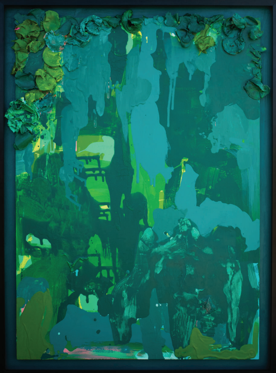
Hiraeth - 2022 Enamel on Canvas 34x46 Inches