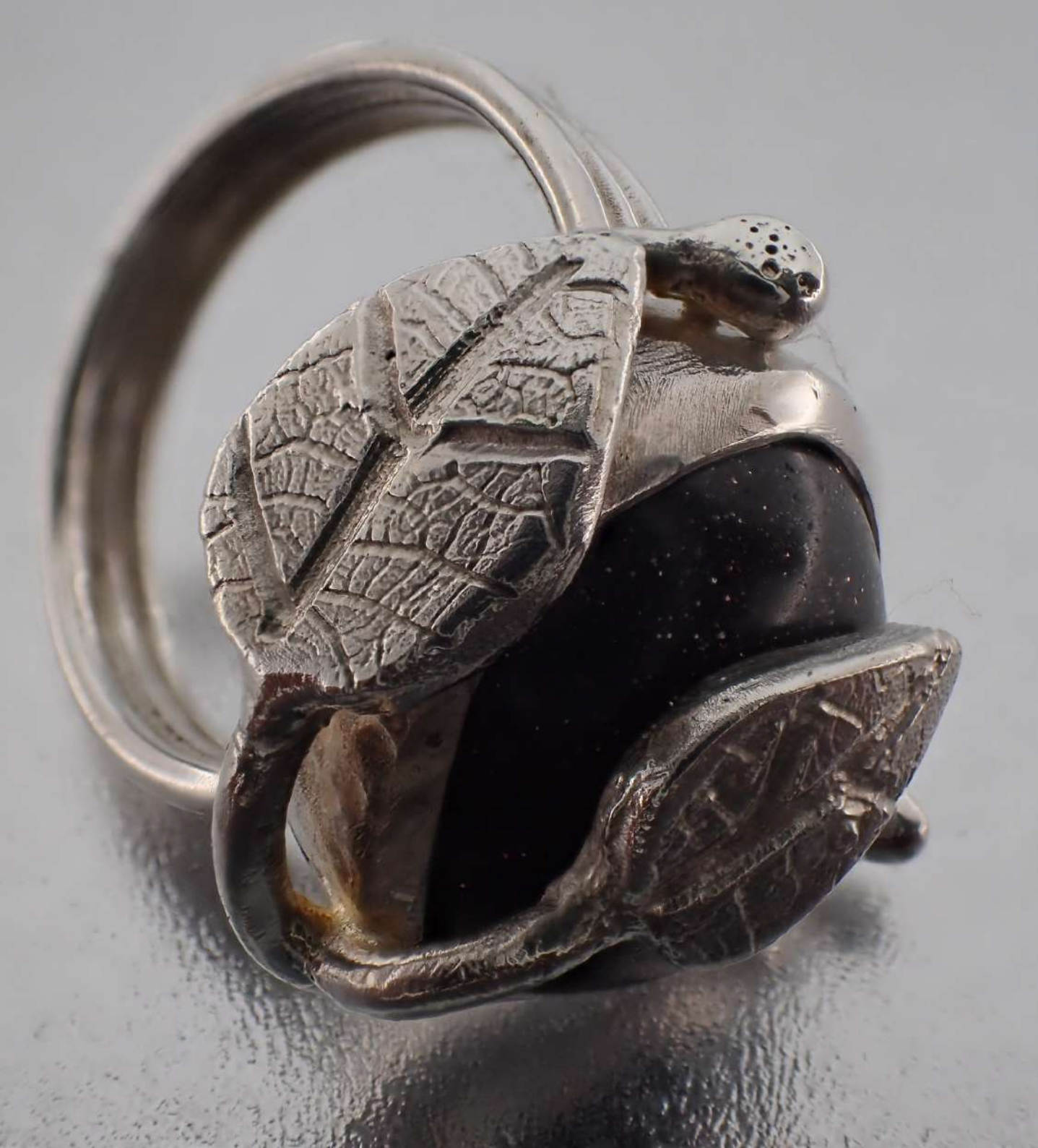
Bloom - 2017 Sterling Silver Moonstone 27 mm X 18 mm X 18 mm