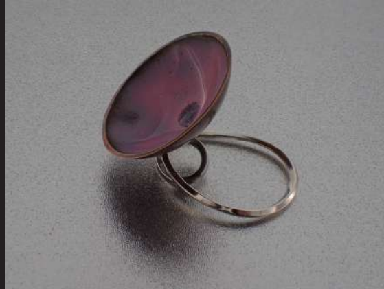
Enamel Elegance 3 - 2019 Sterling Silver, Enamel 36 mm X 27 mm X 27 mm