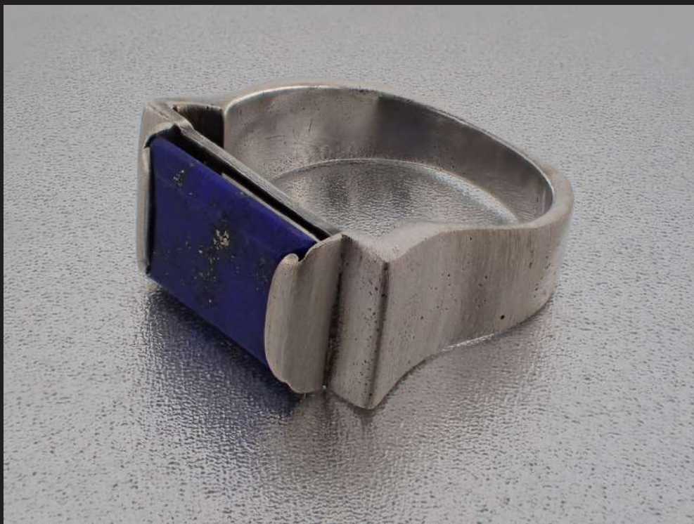
Blue - 2021 Sterling Silver, Lapis Lazuli 24 mm X 21 mm X 8 mm