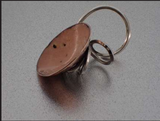
Enamel Elegance 2 - 2019 Sterling Silver, Enamel 38 mm X 21 mm X 17 mm