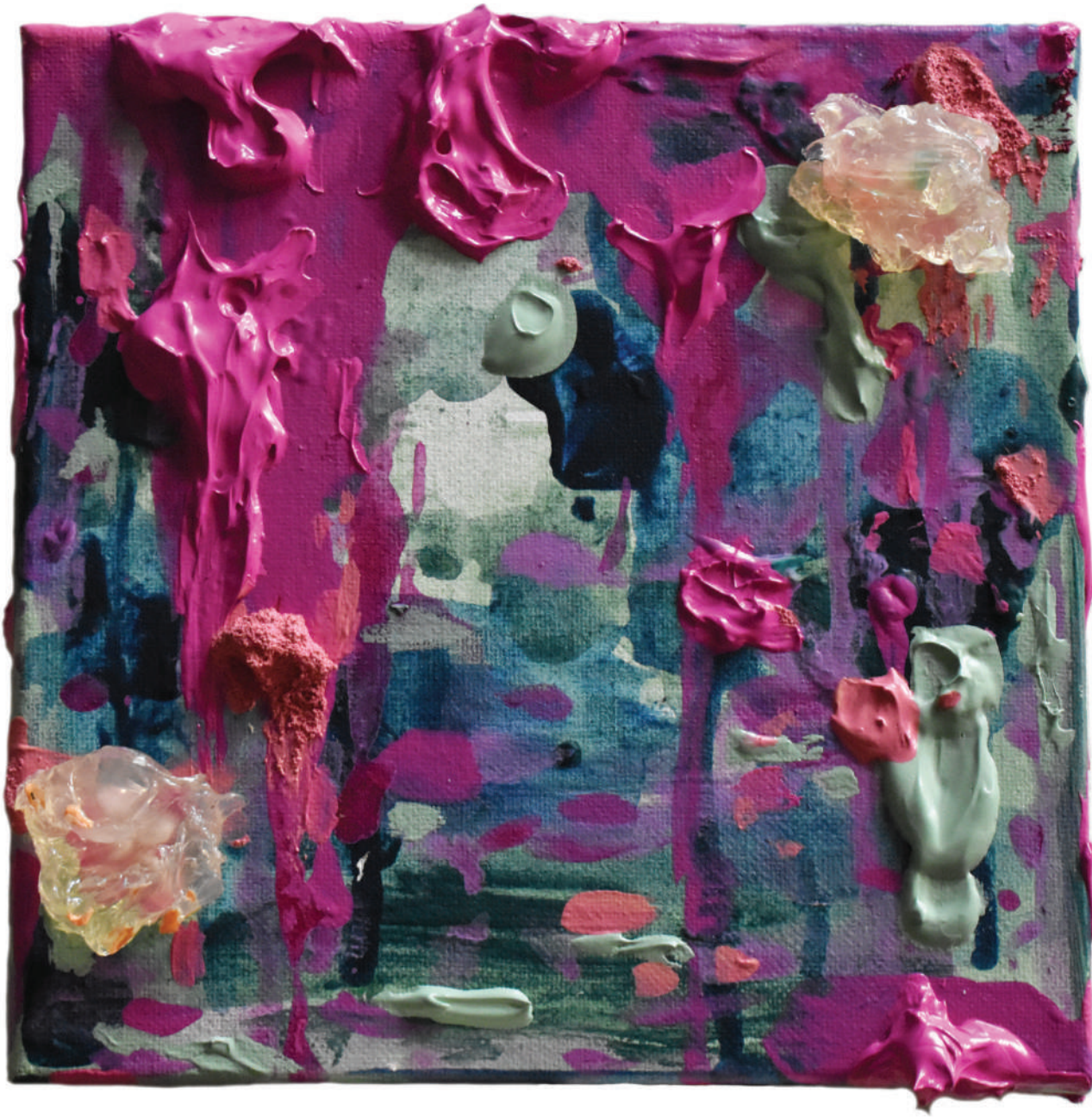
An Excerpt From My Diary - 2023 Acrylic on Canvas 8x8 Inches