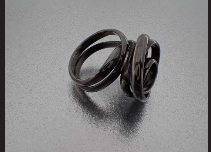
Wire Sketch 2 - 2019 Sterling silver 25 mm X 19 mm X 17 mm