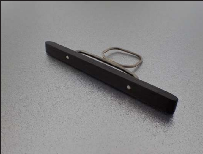
Black - 2022 Ebony Wood, Sterling Silver 31 mm X 74 mm X 6 mm