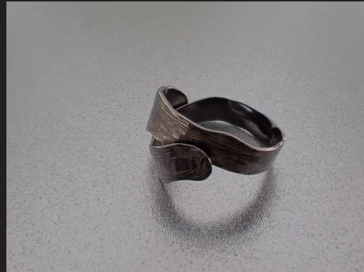
Eternal Embrace 2 - 2020 Sterling Silver 23 mm X 23 mm X 14 mm