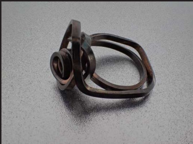
Wire Sketch 3 - 2019 Sterling silver 28 mm X 22 mm X 20 mm