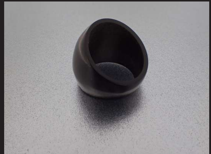
Organic Odyssey 10 - 2020 Amber Wood 26 mm X 25 mm X 22 mm