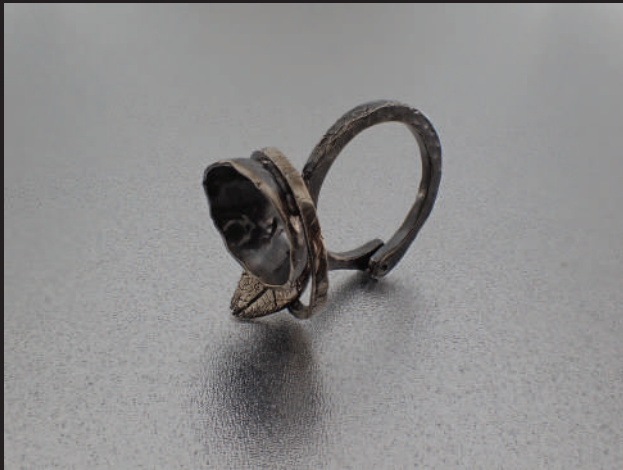
Bloom 1 - 2021 Sterling Silver 27 mm X 20 mm X 15 mm