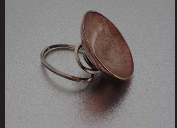
Enamel Elegance 4 - 2019 Sterling Silver, Enamel 31 mm X 26 mm X 27 mm