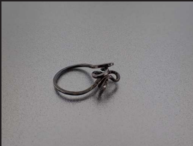
Wire Sketch 9 - 2020 Sterling Silver 31 mm X 25 mm X 5 mm