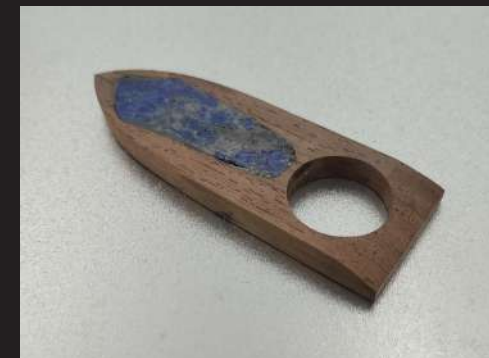
Organic Odyssey 9 - 2019 Sheesham Wood, Lapiz Lazuli 74 mm X 26 mm X 7 mm