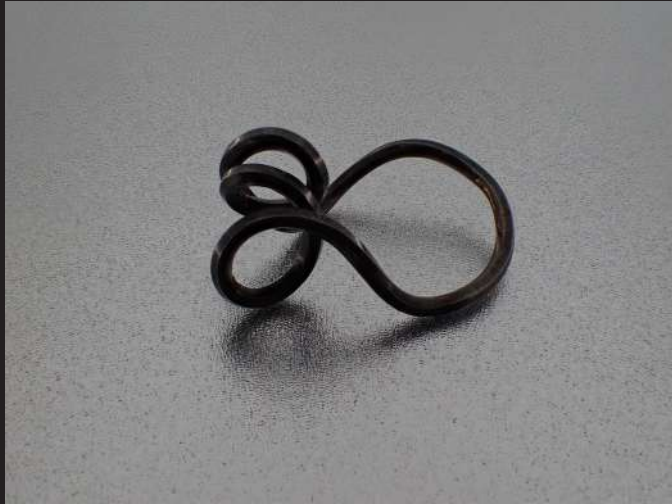
Silver Whisper 1 - 2022 Sterling silver 27 mm X 20 mm X 9 mm