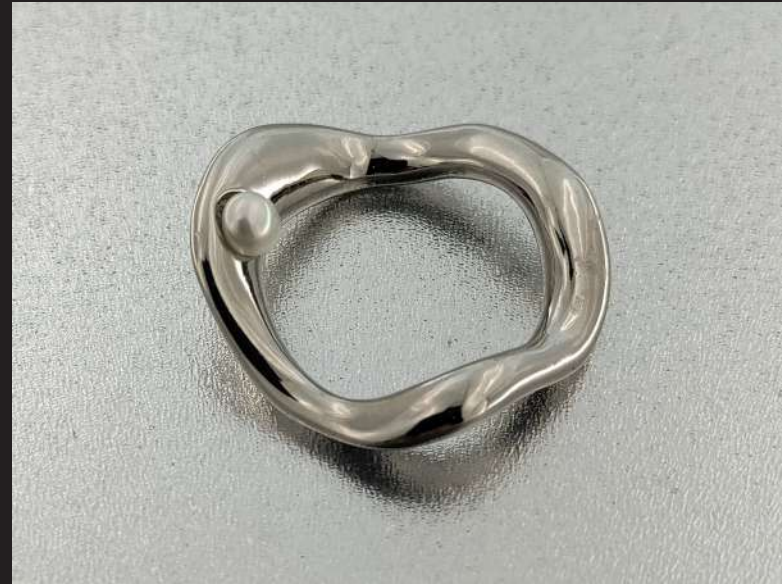
Ripple Effect 2 - 2023 Sterling Silver, pearl 26 mm X 24 mm X 4 mm