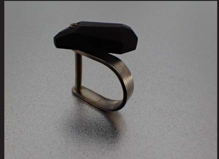
Rotation - 2020 Sterling Silver, Brass, Ebony Wood 27 mm X 25 mm X 5 mm