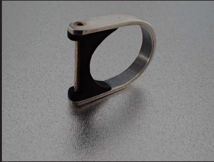
Techno 2 - 2020 Sterling silver, Ebony wood, brass 25 mm X 22 mm X 14 mm