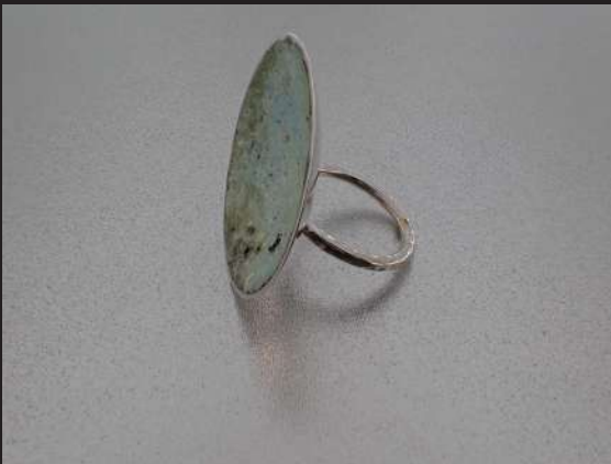
Enamel Elegance 5 - 2021 Sterling Silver, Enamel 25 mm X 29 mm X 29 mm