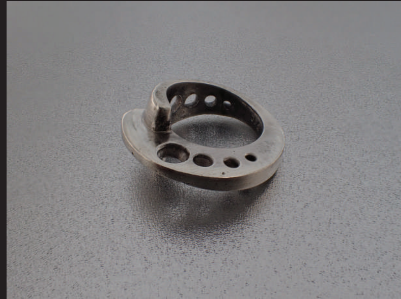
Techno I- 2018 Sterling Silver 25 mm X 24 mm X 10 mm