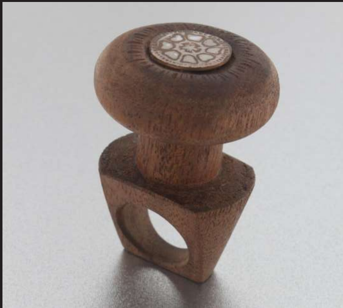
Carrier 1 - 2021 Copper, Enamel, Sheesham Wood 58 mm X 42 mm X 42 mm