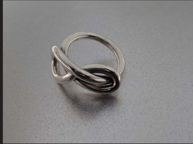
Infinity - 2018 Sterling Silver 26 mm X 26 mm X 10 mm