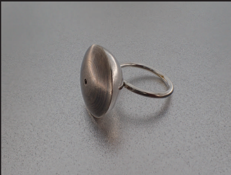
Flower Ring - 2019 Sterling Silver 30 mm X 20 mm X 20 mm