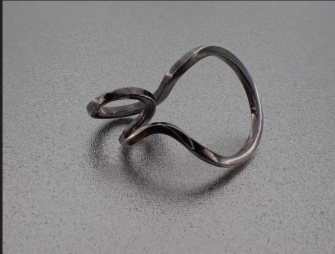
Silver Whisper 2 - 2020 Sterling Silver 31 mm X 21 mm X 12 mm