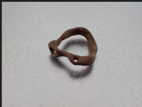
Organic Odyssey 7 - 2022 Sheesham Wood 20 mm X 21 mm X 3 mm