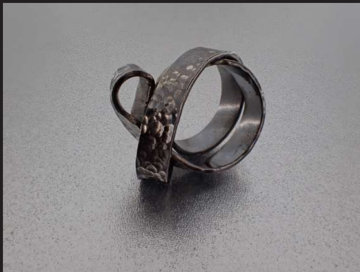
Infinity 1 - 2018 Sterling Silver 26 mm X 20 mm X 10 mm