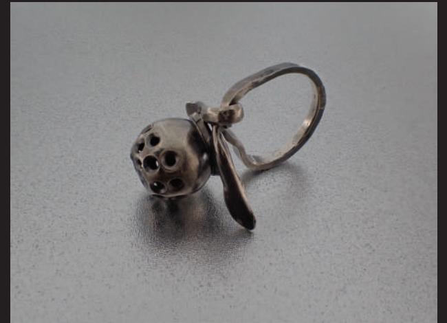
Memory 2 - 2020 Sterling Silver 30 mm X 20 mm X 10mm