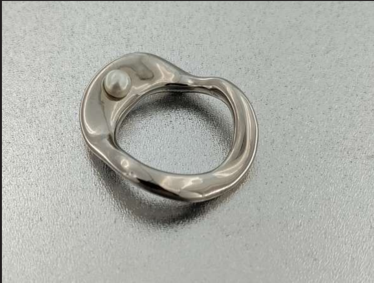
Ripple Effect 1 - 2023 Sterling Silver, pearl 24 mm X 22 mm X 4 mm