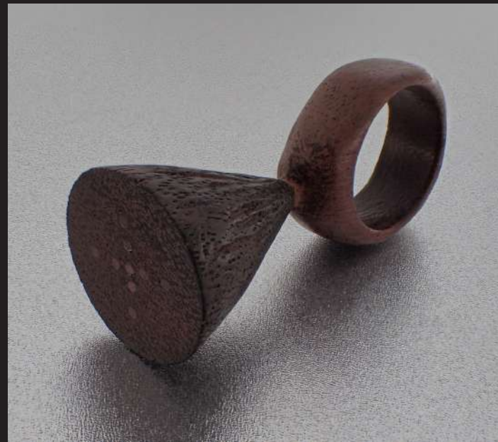
Carrier 4 - 2022 Purple Wood, Copper 54 mm X 21 mm X 21 mm