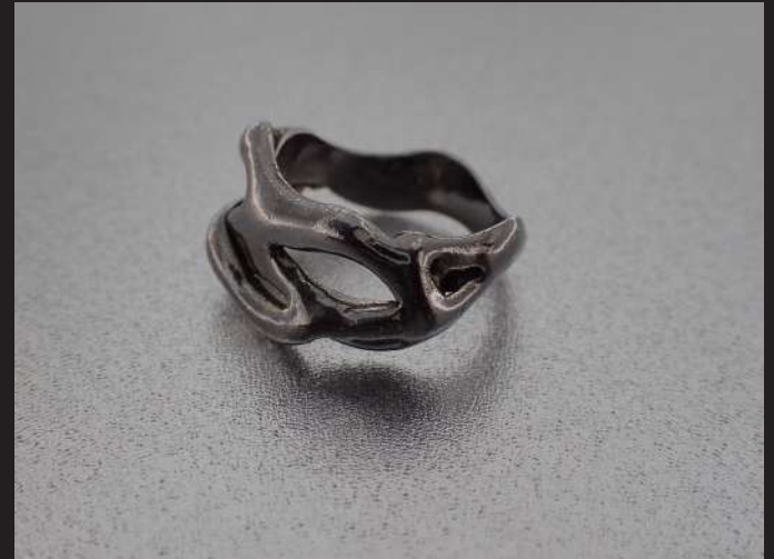
Cut and paste - 2020 Sterling Silver 19 mm X 19 mm X 8 mm