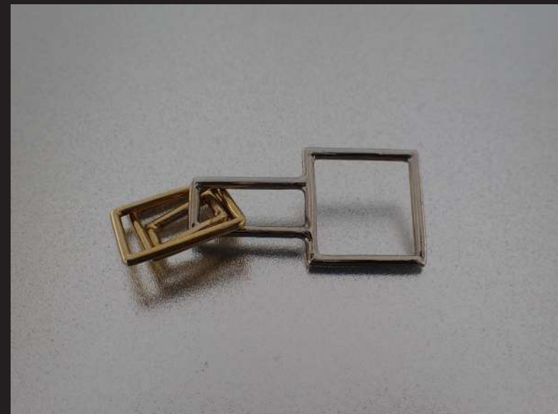
Wire Sketch 13 - 2022 Silver and Gold-plated copper 40 mm X 21 mm X 5 mm