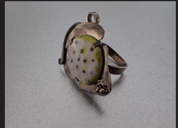
White and Yellow - 2019 Sterling Silver, Enamel 24 mm X 31 mm X 27 mm