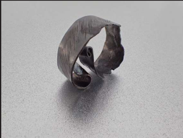
Eternal Embrace 1 - 2022 Sterling Silver 6 mm X 21 mm X 7 mm