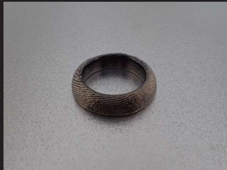
Half moon - 2018 Sterling Silver 24 mm X 24 mm X 5 mm