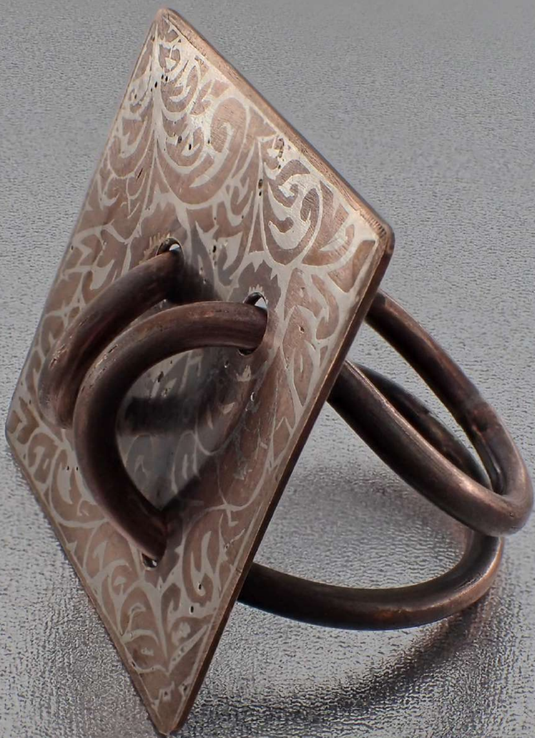
Craft or not -2020 Pure silver inlay in copper 26 mm X 26 mm X 10 mm