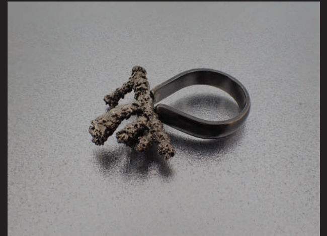
Memory of Tree 2 - 2021 Sterling Silver 39 mm X 28 mm X 5 mm