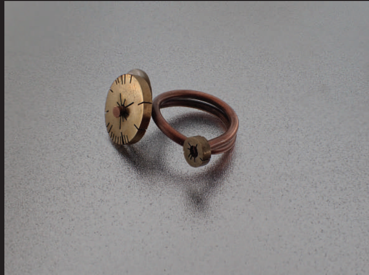
Memory 1 - 2020 Brass, Copper, Mother of pearl 22 mm X 22 mm X 15 mm