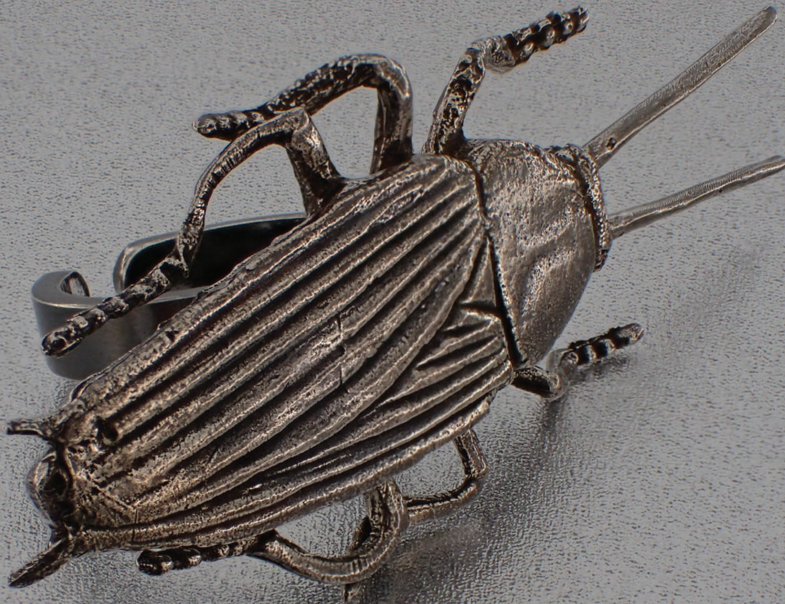
Invader - 2018 Sterling Silver 24 mm X 63 mm X 27 mm