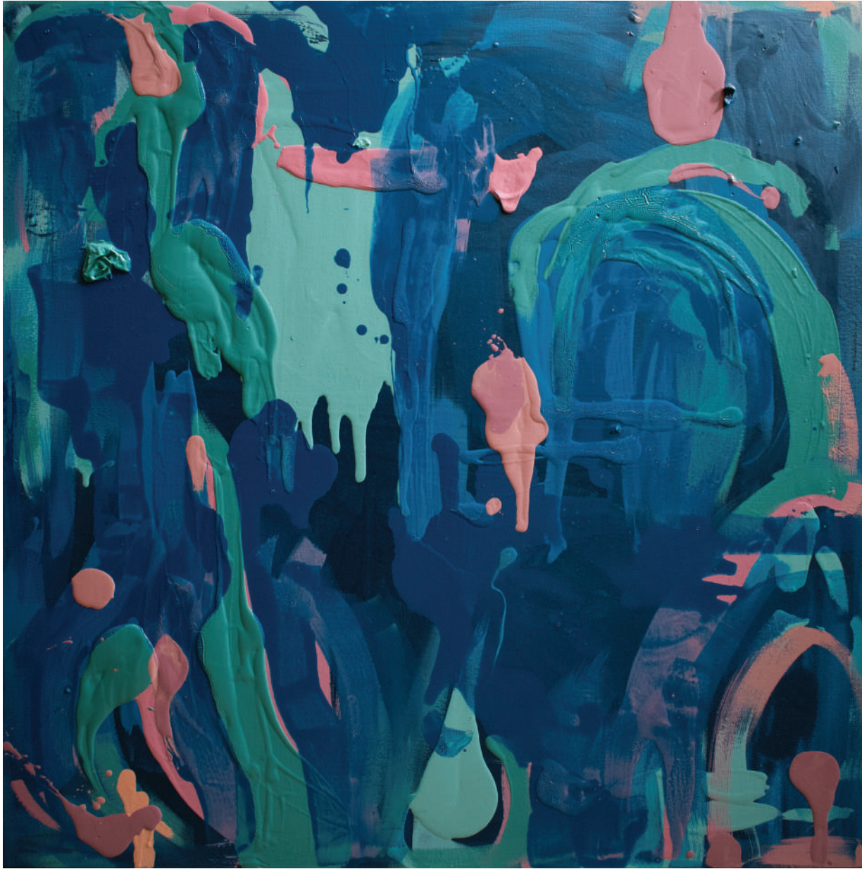
Missing Persons - 2023 Enamel on Canvas 36x36 Inches