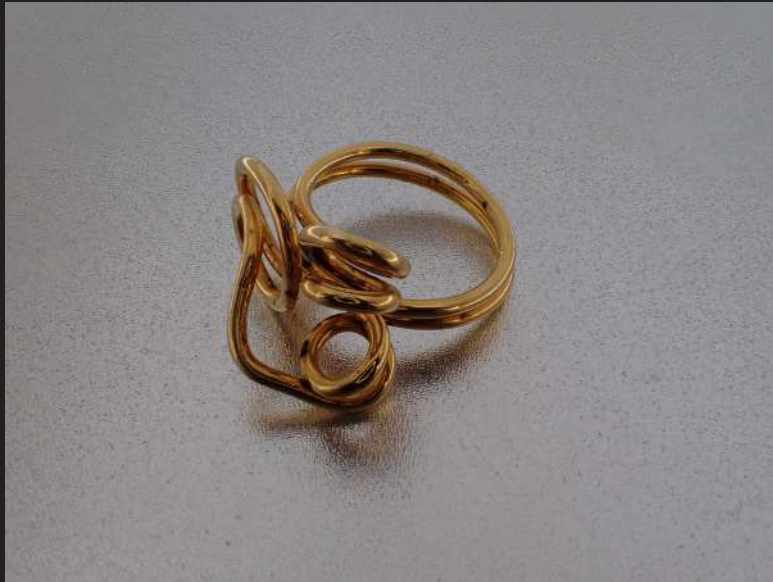
Wire Sketch 39 - 2021 Gold plating on Copper 29 mm X 25 mm X 13 mm