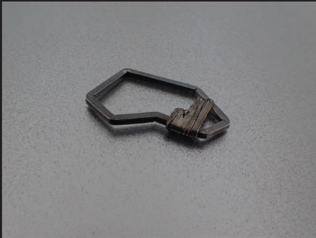
Memory of Tree 1 - 2021 Sterling Silver 33 mm X 21 mm X 3 mm