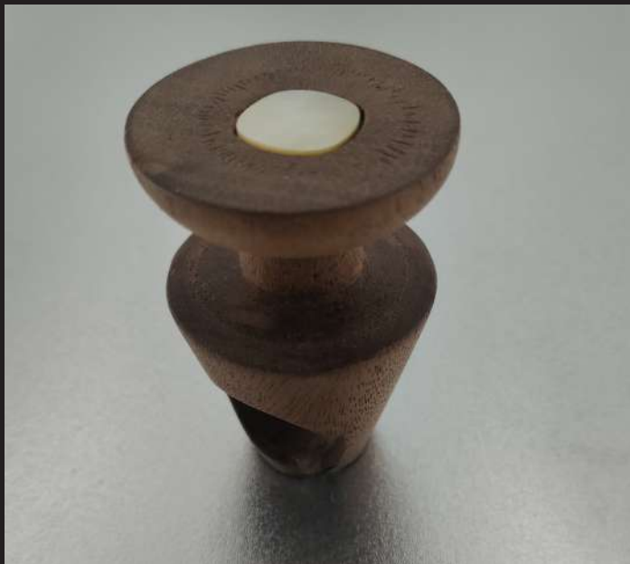
Carrier 3 - 2022 Sheesham Wood, Mother of pearl 55 mm X 40 mm X 40 mm