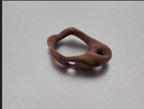
Organic Odyssey 5 - 2022 Sheesham Wood 37 mm X 26 mm X 5 mm