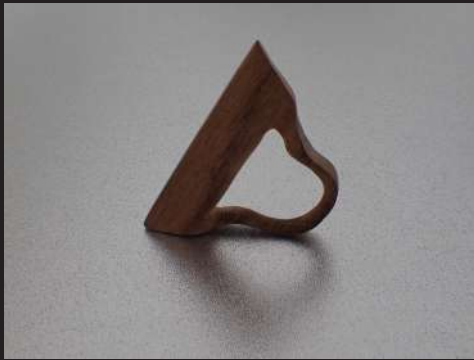
Organic Odyssey 1 - 2022 Sheesham Wood 31 mm X 48 mm X 4 mm