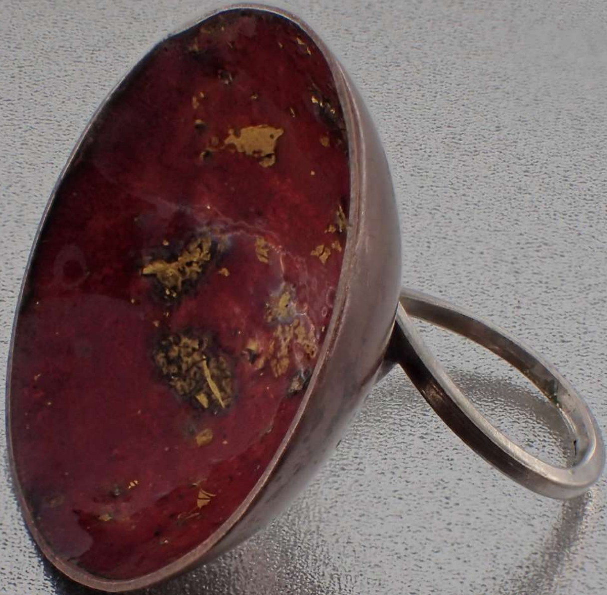
Enamel Elegance I - 2020 Sterling Silver, Gold leaf, Enamel