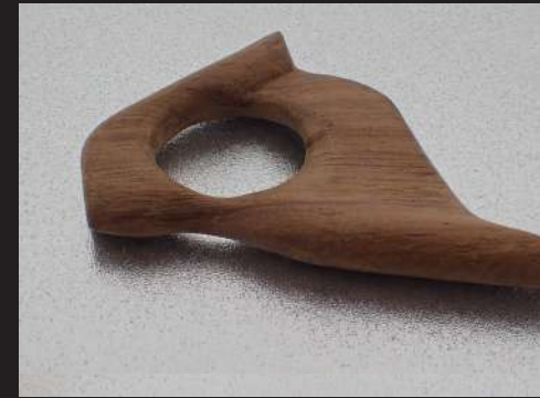
Organic Odyssey 3 - 2022 Sheesham Wood 51 mm X 34 mm X 5 mm