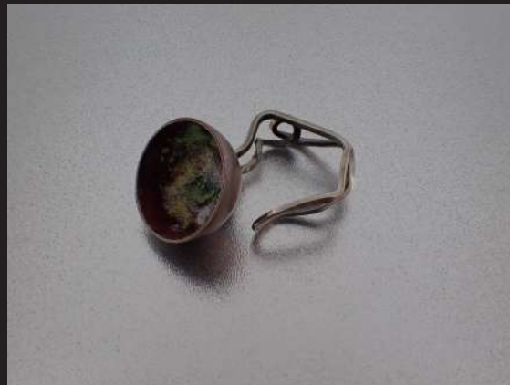
Enamel Elegance 6 - 2019 Sterling Silver, Copper, Enamel 37 mm X 27 mm X 19 mm