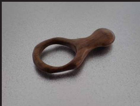
Organic Odyssey 9 - 2022 Sheesham Wood 52 mm X 25 mm X 7 mm