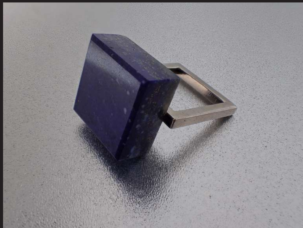
Blue Square - 2022 Sterling silver, Lapis Lazuli 25 mm X 19 mm X 17 mm