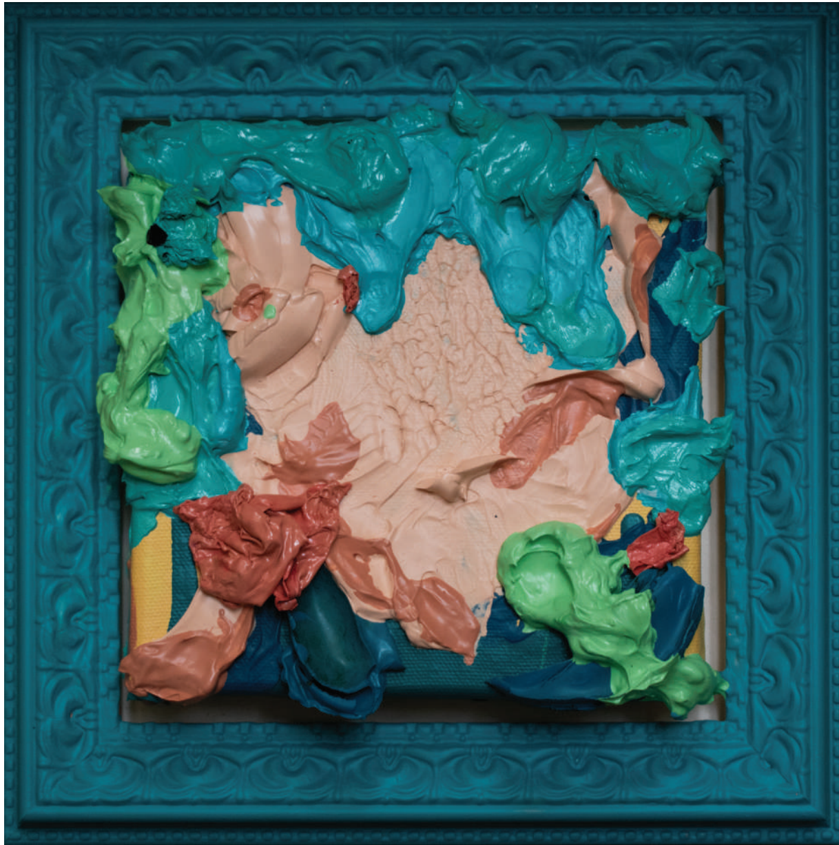
If I Vanish - 2023 Acrylic on Canvas 9x9 Inches