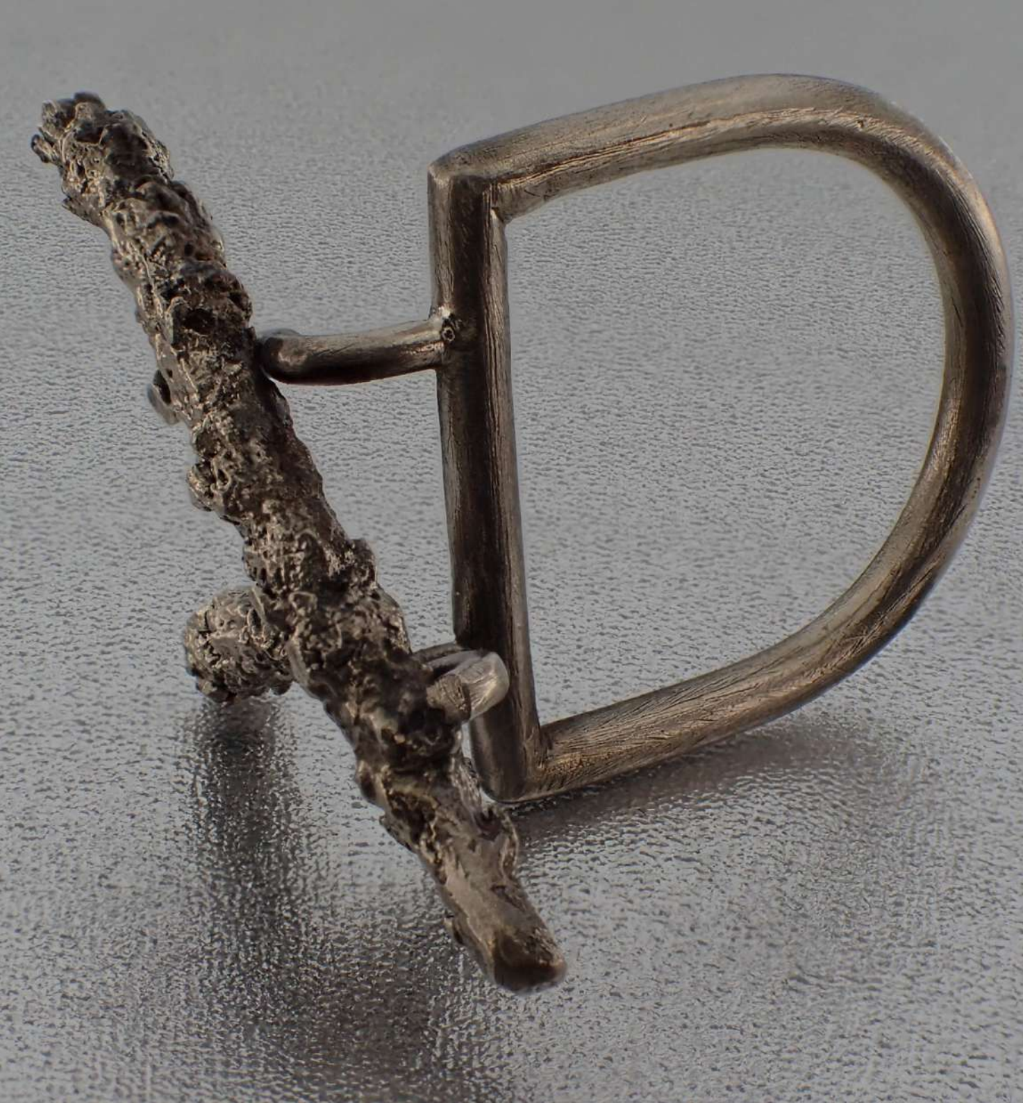
A walk in a jungle - 2022 Sterling Silver 25 mm X 18 mm X 20 mm