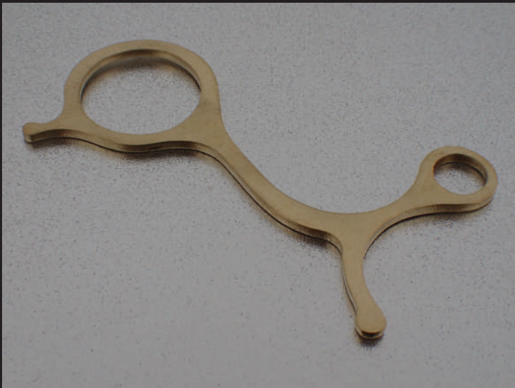
Covid Ring - 2020 Brass 80 mm X 24 mm X 3 mm