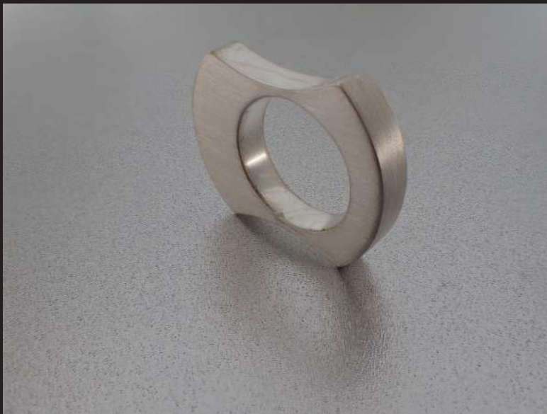
Hollow ring - 2022 Sterling Silver 31 mm X 25 mm X 5 mm