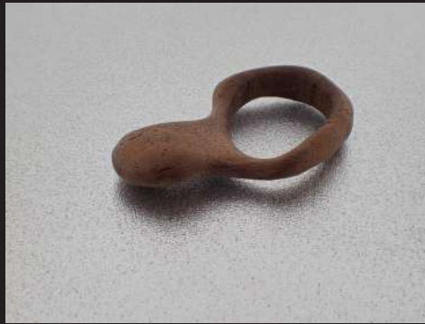
Organic Odyssey 2 - 2022 Sheesham Wood 37 mm X 22 mm X 6 mm