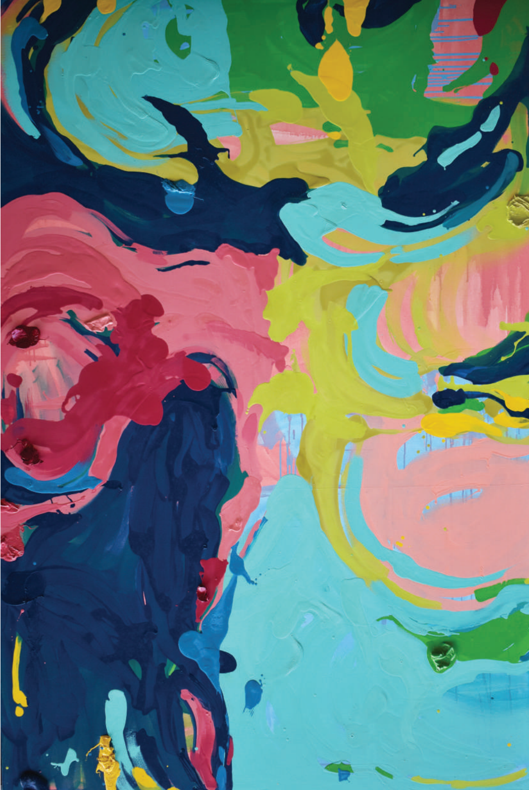
Small Episodes of Deja Vu - 2023 Enamel on Canvas 48x72 Inches