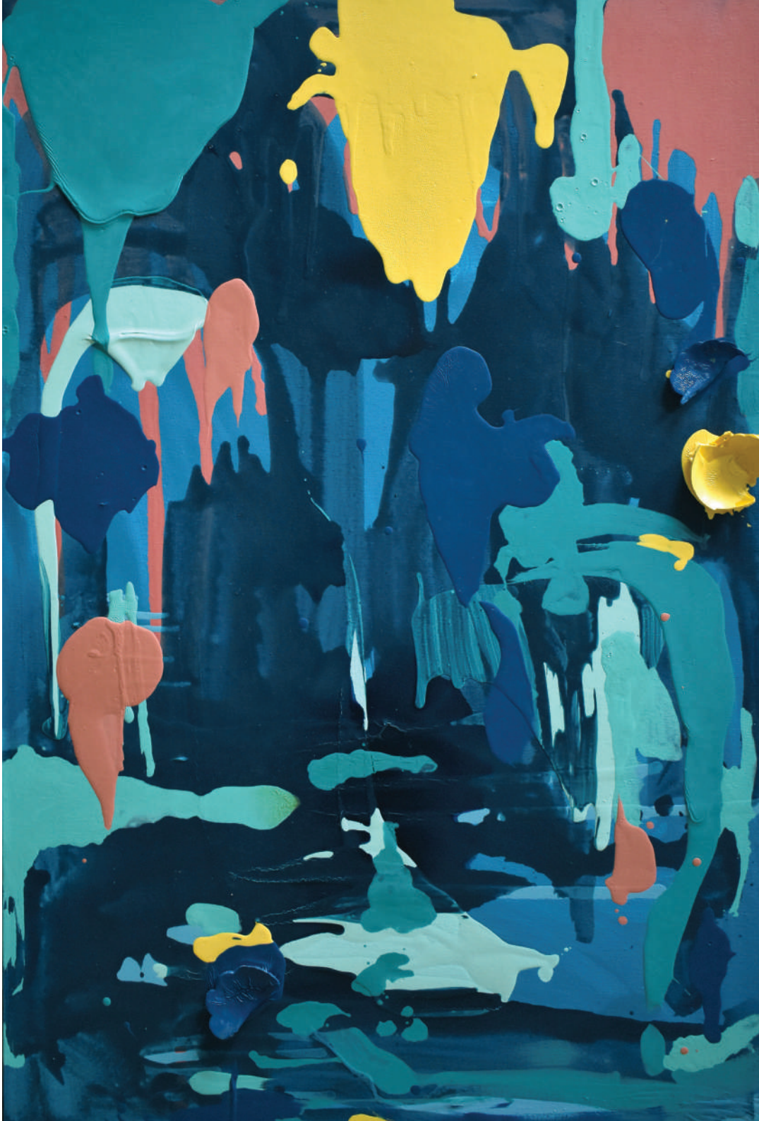
That Eerie Feeling - 2023 Enamel on Canvas 24x36 Inches