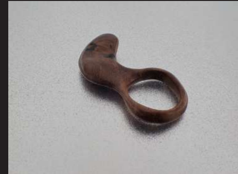
Organic Odyssey 8 - 2022 Sheesham Wood 40 mm X 21 mm X 5 mm