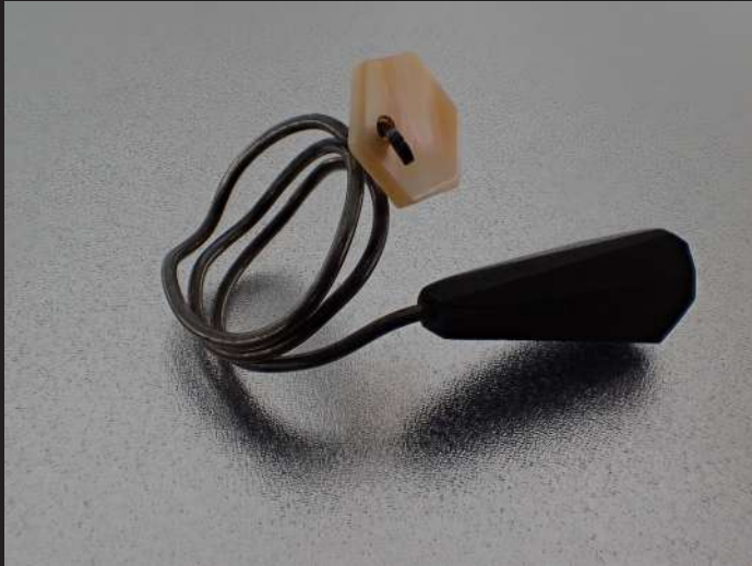
Antique Allure - 2022 Ebony Wood, Mother of pearl, Sterling Silver 44 mm X 20 mm X 35 mm