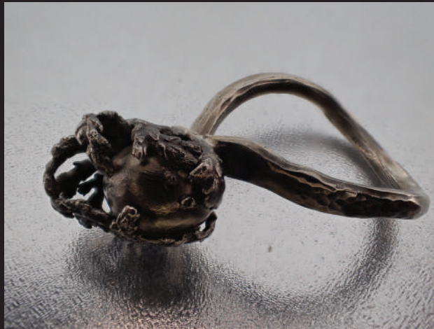
Lost and found - 2022 Sterling Silver 32 mm X 21 mm X 6 mm