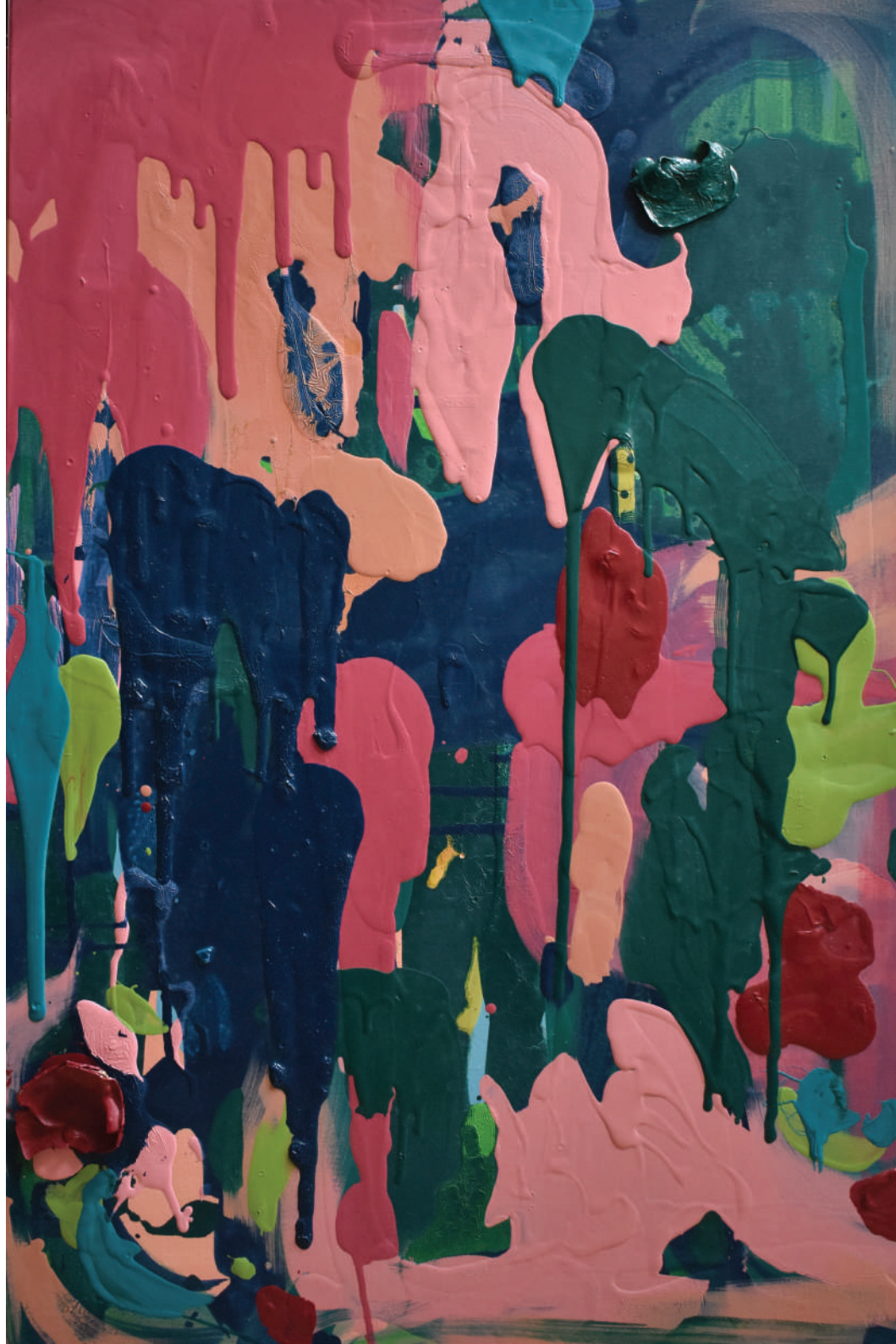
Nobody is Home - 2023 Enamel on Canvas 24x36 Inches