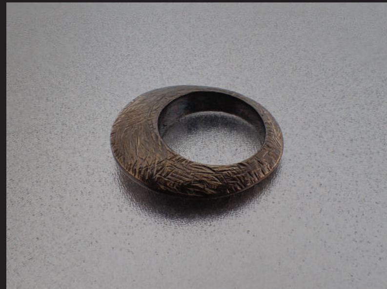
Oval - 2020 Sterling silver 25 mm X 22 mm X 5 mm