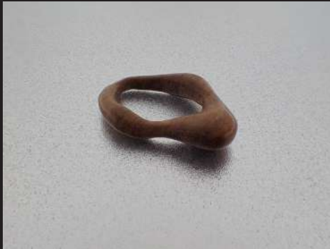
Organic Odyssey 4 - 2022 Sheesham Wood 30 mm X 21 mm X 6 mm